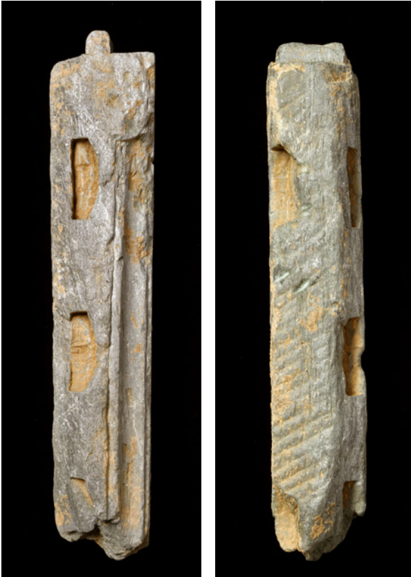
Figure 72a-b SS I reg. 59 (ACT)

structure, even if it does not appear to be solid, had to be extremely resistant and ready to support, like a pile-dwelling, the positioning of the Frieze.