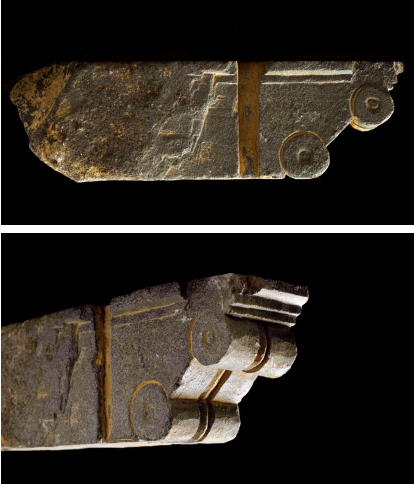
Figure 74a-b SS1 27 (ACT)

ed considerably: in this way the supporting frame below and the locking frame above would have been solidly set into the face of second storey as it was raised by the workmen. This way, the panel was set firmly against the body of the Stupa. Thus the work of the sculptors and workmen proceeded in parallel.