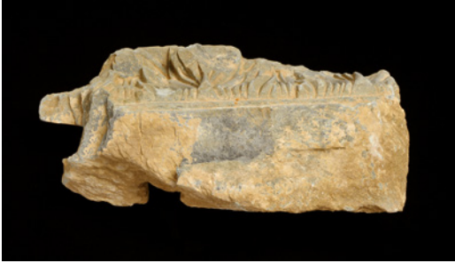
Figures 73a-c SS I reg. 56 (ACT)

vallo tra essi, caratterizzanti aree differenti, la presenza delle barrette richiama l'ambiente romano nella rielaborazione che esso compie nella prima età augustea di motivi ellenistici e nella loro diffusione [...] Compare a Roma in monumenti della prima età augustea (Regia, Tempio di Saturno, Tempio di Apollo Palatino, Tempio di Apollo in Circo). (Faccenna 2001, 177 fn. 76) 3