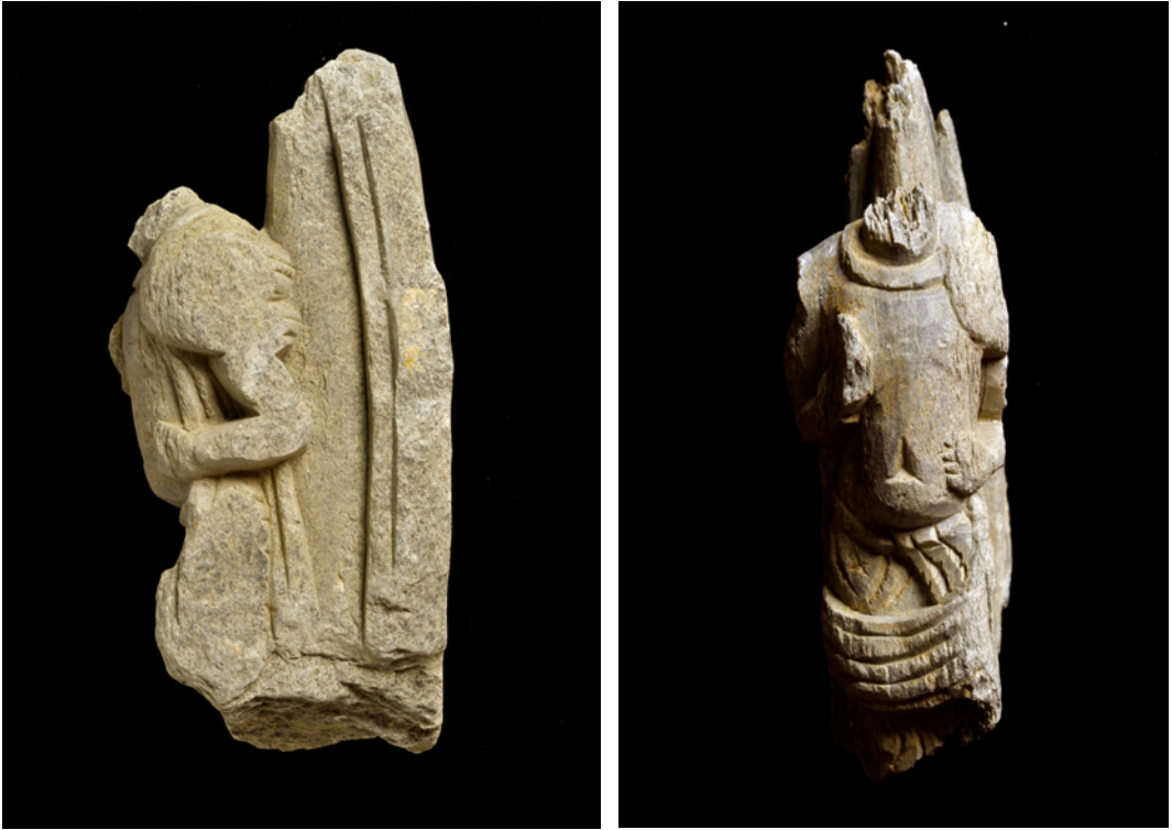
Figure 76a-b SS I 182 (ACT; photo by Aurangzeib Khan)

to the harmikā is a pillar in green chlorite schist, 20 cm in height without base and topping (pillar A 45, with eight-petalled lotus flower at the ends and band decorated with astragali and beads; Faccenna 1995a, fig. 264b). Although Faccenna's idea that these could have belonged to the top railing of the chattravali ( harmikā ) is the only one that seems possible (p. 547), in the drawings illustrating this text, the vedikā has been deliberately omitted.