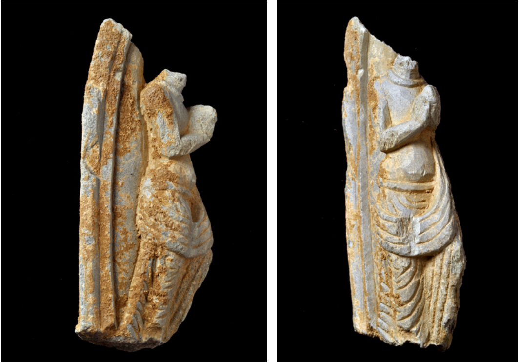
Figure 75a-b SS I 62 (ACT)

the side. 8 They were set at regular intervals (on one of the stupas comparable to ours in size, at least every 2 m); the garland was hung behind the projecting volute, clearly visible where it fell between the brackets.