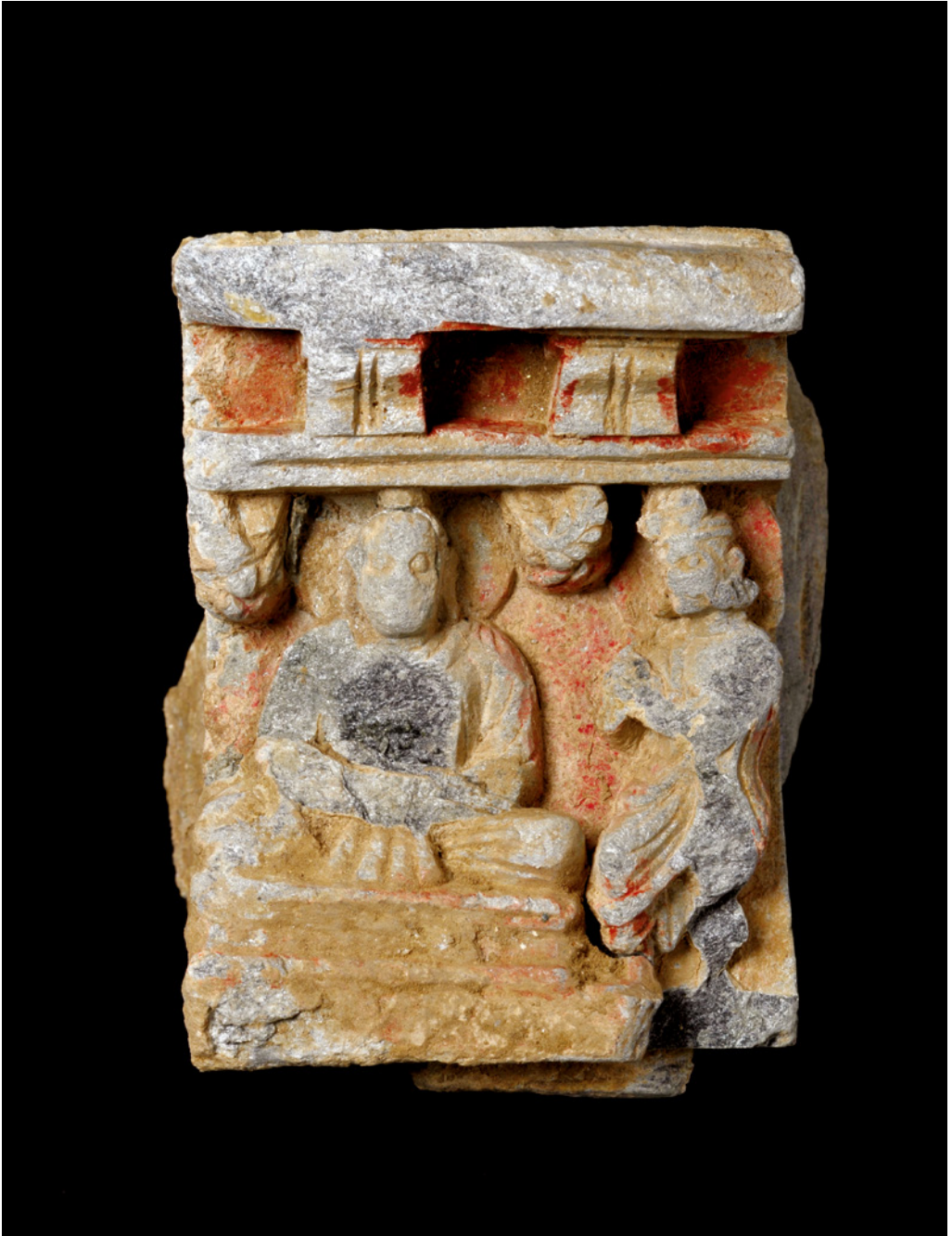
Figure 78 SSI 12, minor stupa (ACT)