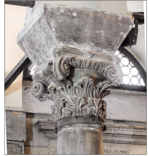
Figure 5 Composite capital close to the “Type 5 Pensabene”. Late 2nd-early 3rd century A.D. Marble. H. cm 51; I crown cm 16; II crown cm 13.5; Ø cm 39, 8 ca. Conservation status: good, all the leaves are chipped and there are probable signs of reworking and restoration. Photo: Böhm Mariacher 1954, 44 fn. 3; Sperti 2004, 236; Pilutti Namer 2015