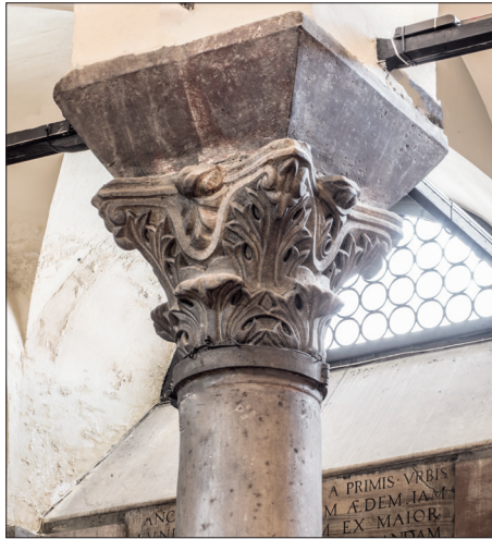
Figure 7 Early Byzantine Corinthian “lyre-shaped” capital. Late 5th-early 6th century AD. Marble. H. cm 48; I crown cm 20; II crown cm 27; Ø cm 36.3. Conservation status: intact.