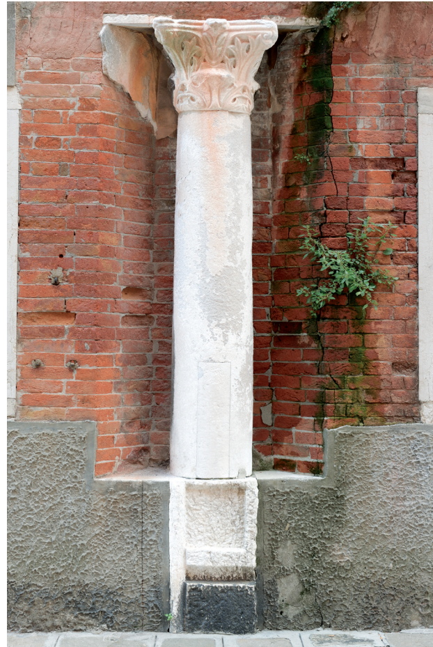
Figure 1 Early Byzantine capital of the 'V' or 'lyre' type, with part of a column, in Rio Terà San Silvestro (CC licence)

No. 6 [fig. 7], on the other hand, is a Corinthian capital of the so-called 'lyre' type. It is in fact characterised by two crowns of four large trilobed acanthus leaves and the 'U' shape of the volutes (similar to the lyre, hence the name). In the canonical form these usually include a sprig, a flower or an inverted leaf, whereas in the current piece there is a stylised phytomorphic shoot. As Claudia Barsanti has noted, the type derives from classical prototypes, namely capitals with double 'S' volutes, so-called 'lireggianti', manufactured in the micro-Asiatic area during the 2nd/3rd century AD and exported throughout the Mediterranean. 11 The type is widespread