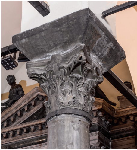
Figure 3 Asian Corinthian capital of the “Type 5 Pensabene”. Late 2nd-early 3rd century AD. Marble. H. cm 56; I crown cm 19.5; II crown cm 14.5; Ø cm 41. Conservation status: good. Photo: Böhm Mariacher 1954, 44 fn. 3; Sperti 2004, 236; Pilutti Namer 2015