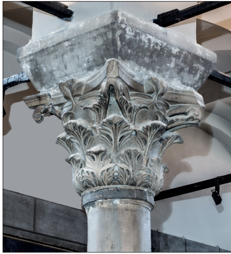
Figure 4 Asian Corinthian capital of the “Type 5 Pensabene”. Late 2nd-early 3rd century A.D. Marble. H. cm 56; I crown cm 23.5; II crown cm 20; Ø cm 44.6 ca. Conservation status: good. Photo: Böhm Mariacher 1954, 44 fn. 3; Sperti 2004, 236; Pilutti Namer 2015