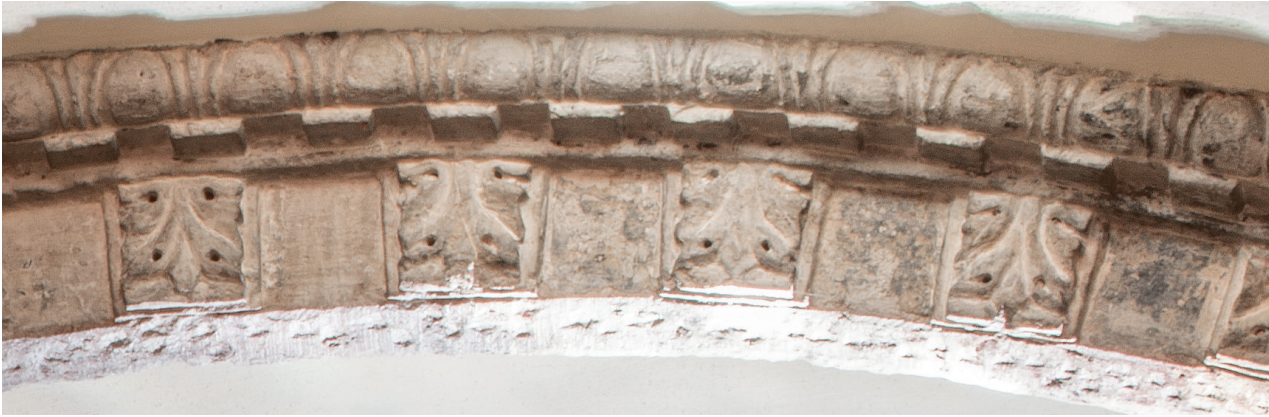
Figure 11 Venice, Rialto. Church of San Giacomo. Detail of the all'antica medieval frame. Photo: Böhm, elaborated by G. Guidarelli

when all or almost all of the building works were the result of human will and human and animal effort. To emphasise, therefore, with pietas , the sacral antiquity of the place, the parish priest Natale Regia, who in 1531 undertook major restoration work involving far-reaching architectural modifications in marmore notanda , 23 may also have intervened in the replacement of some of the ancient capitals in place in the church. This intervention would explain the unusual presence in Venice of as many as four capitals belonging to the Roman imperial age (1, 3, 4, 5) 24 besides a more common piece from the early Byzantine age and a second belonging to a Venetian production from the medieval age. Of Byzantine tradition, the quincux is emphasised by a frame connected with the classical tradition, with ovoli and lancets , which could