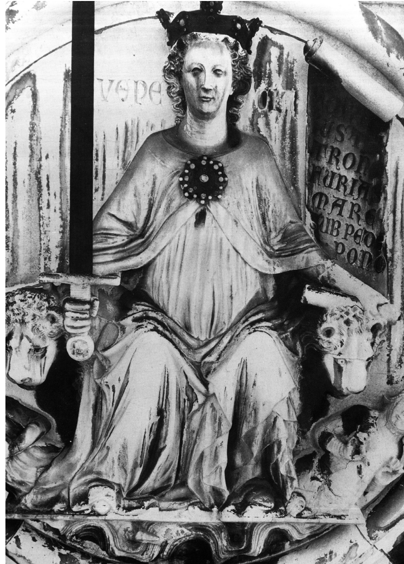
Figure 10 Filippo Calendario, Venice as Justice. 14th century. Venice, Doge's Palace.