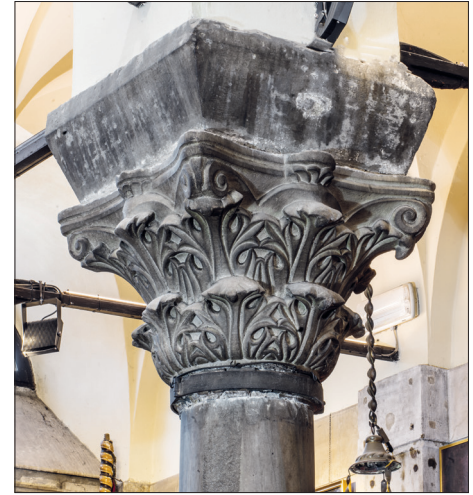
Figure 8 Corinthian capital imitating the proto-Byzantine “Kautzsch Type IV” with two crowns of leaves. Second half 11th century AD. Marble. H. 59 cm; I crown 19 cm; II crown 25.5 cm; Ø 45.5 cm.