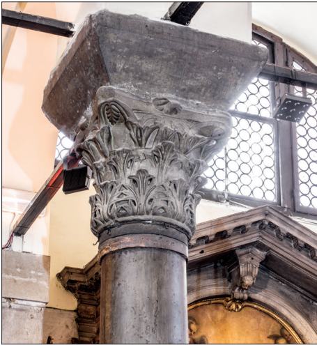
Figure 6 Asian Corinthian capital of the “Type 11 Pensabene”. Late 3rd-early 4th century AD. Marble. H. cm 56; I crown cm 22; II crown cm 14; Ø cm 41 ca. Conservation status: good.