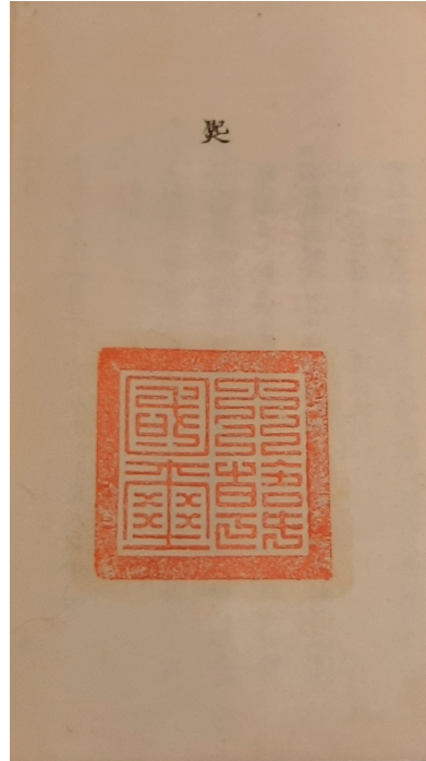
Figure 4 Great Seal of Korea affixed on the instrument of ratification contained in copy 2-C of the Belgium-Korea Treaty

the inscription “Traité passé entre Sa Majesté le Roi des Belges et Sa Majesté l’Empereur de Corée” and an illustration of the two national flags. The two copies in Chinese, 2-C and 3-C [fig. 2], bear the signature of Léon Vincart, the seal of the Belgian consulate general in Seoul, and the seal of the Minister of Foreign Affairs. Their covers are slightly different: the cover of the ratified copy 2-C bears the inscription “Treaty of Commerce between the Great Korea and the Great Belgium” ( Tae Han’guk Tae Pirisiguk t’ongsang choyak 大韓國大比利時國 通商條約) whereas that of copy 3-C bears the inscription “Treaty of Commerce between the Great Belgium and the Great Korea” ( Tae Pirisiguk Tae Han’guk t’ongsang choyak 大比利時國 大韓國通商條約). Furthermore, copy 2-C contains on the last pages of the treaty the instrument of ratification [fig. 3] with the Great Seal of Korea ( Tae Han kuksae 大韓國璽) [fig. 4] affixed. The French copy 1-F that was supposed to be kept in the Belgian consulate is missing. In 1917, Belgium decided to close its consulate in Seoul and entrust its