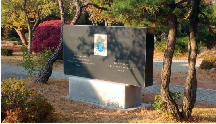
Figure 7 Papal monument erected “in honor of the three Blessed Martyrs of Haemi”.

their faith, and thus led great lives. Thus, the attention given to Haemi as an international holy site was used not only to exalt the martyrs, but to put forth Catholic values in a way that could also resonate with non-Catholics.