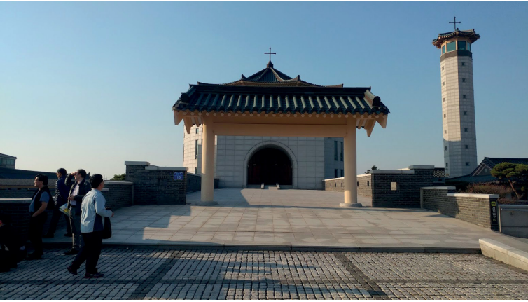
Figure 4 Entrance to Haemi Shrine, with the gate in the center and the observation tower on the right.