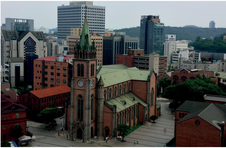
Figure 1 Myŏngdong Cathedral. Namu Wiki. Munhwa chaech'ŏng Kukka munhwa Yusan P't'ŏl (Culture Heritage Administration). https://shorturl.at/gpHOR

Three different pilgrimage routes are presented on the official government Seoul Net website. The routes as they appear there are similar in that each takes approximately two-and-a-half hours to walk and most of the sites are closely connected to religion. 3 For instance, the Seoul route is bookended by two churches. The first is Myŏngdong Cathedral [fig. 1], which is described on the site as the “first Gothic style” church in Korea and the “epicenter of the Korean democratization movement that started in the 1960s”, thus connecting Western architecture and the successful indigenization of a ‘Western’ form of government. Church grounds also reveal French influence in the form of an imitation of the Marian grotto at Lourdes [fig. 2]. The second is Yakh'yŏn Catholic Church [fig. 3], which is presented as the oldest Catholic Church in Korea and has a mixed Romanesque and Gothic style. Another church, Kahoe-dong Catholic Church, is also mentioned, with a focus on it being located in the area where Father Zhou Wenmo, explicitly identified as a Chinese Catholic priest, said his first Mass in Korea.