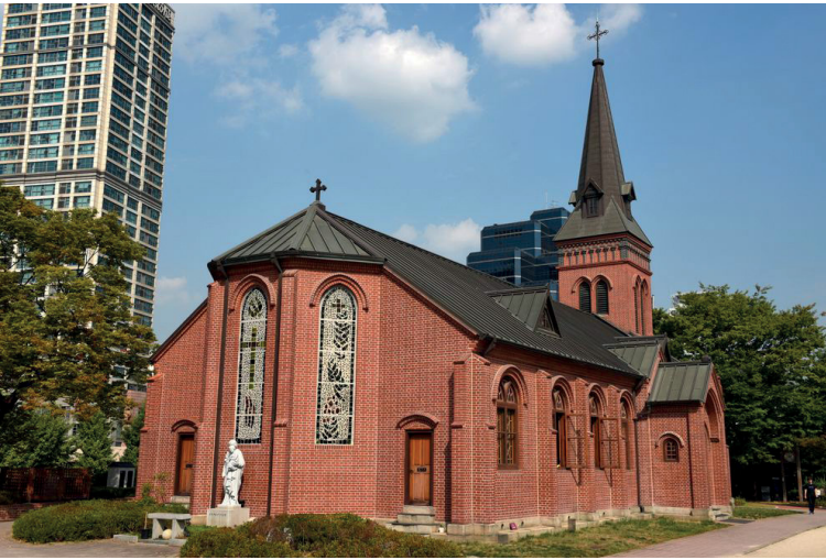
Figure 3 Yakyŏn Parish Church. Namu Wiki. Munhwa chaech'ŏng Kukka munhwa Yusan P't'ŏl (Culture Heritage Administration). https://www.heritage.go.kr/heri/cul/imgHeritage.do?ccimId=6311502&ccbaKdcd=13&ccbaAsno=02580000&ccbaCtcd=11

John Heron [an early Protestant medical missionary], the second director of Kwanghyewŏn, the first Western-style hospital in Korea 5