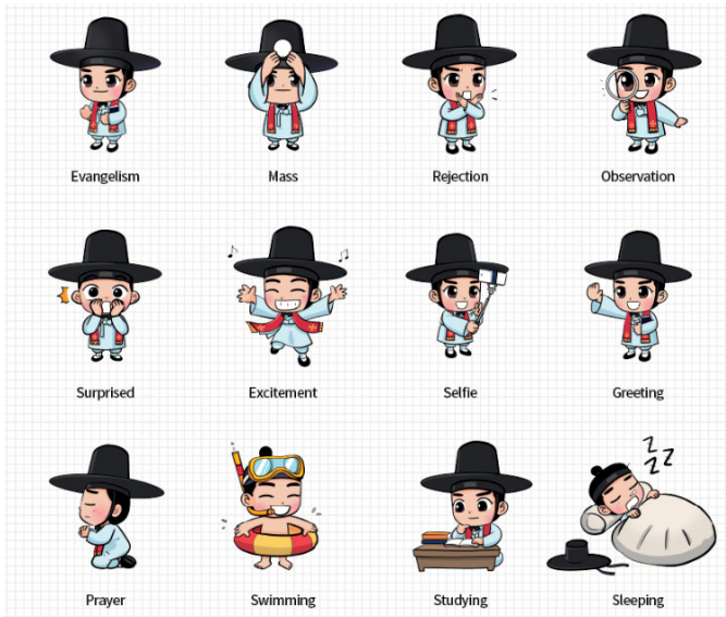
Figure 8 Character models available from the official site at https://www.kimdaegeon.com/_ENG/node/?menu=n050101

SCO. Kim was born in 1821, and the 200th anniversary of Kim's birth was celebrated from 2020 to 2021. Organizers of events, including the Archdiocese of Taejŏn, obtained by UNESCO the recognition of Kim as a "universal patron" and thus were able to note their sponsorship when referring to events. For example, the logo of the official site includes the phrase "Celebrated in association with UNESCO". 12 The official website includes advertisements for concerts and other cultural performances, a Minecraft recreation of Solmoe, Kim Taegŏn apps and character models [fig. 8], and a downloadable han'gŭl font based on the first priest's own handwriting [fig. 9]. There is also a dedicated YouTube channel that includes a video of a young woman studying at a library about Kim Taegŏn who suddenly falls through the floor and is teleported to the gates of Solmoe (Kim 2021). She meets a man there and together they tour Solmoe, visiting the statue of Pope Francis praying in front of the reconstruction of Kim's home (there are at least three different statues of Pope Francis at Solmoe) and one of Kim's statue, with the announcer proclaiming UNESCO's recognition of the priest. In this way, secular and religious authorities are knitted together to recognize the virtues of Korea through its first priest.