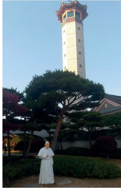
Figure 6 Pope Francis statue at the foot of the observation tower.