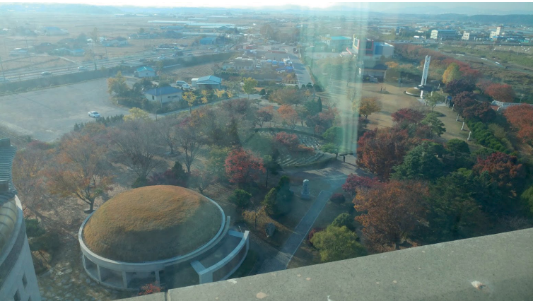
Figure 5 View from the observation tower of the shrine and the city beyond it.