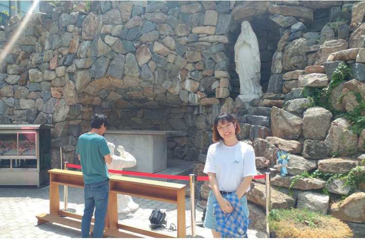
Figure 2 Lourdes Grotto, revealing French influence, at the foot of Myŏngdong Cathedral.

same route the Sŏsomun Historical Park is included as a place of Catholic execution. Likewise, along the Hangang Pilgrimage route can be found the Chŏltusan Martyr's Shrine, where large numbers of Catholics were executed in the Pyŏngin Persecution, which began in 1866. A new Catholic site was even created, the Specialized Section of Hangang Pilgrimage Route, which contains four paths: dust, stone, forest, and flower. Pilgrims are encouraged to reflect on their own past