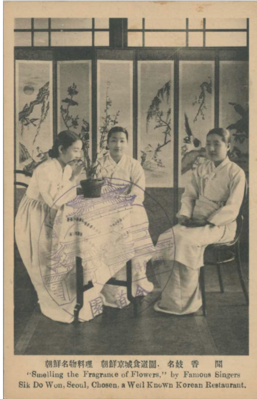
Figure 15 Anonymous, Kisaeng at a Korean Restaurant. Colonial period, Korea. Photography postcard. Collection of Yamamoto Shunsuke, Kyoto. © International Research Centre for Japanese Studies, Kyoto, Japan