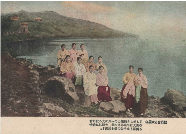
Figure 11 Anonymous, Kisaeng with the Taedong River and the Peony Platform . Colonial period, Korea. Photography postcard. Collection of Yamamoto Shunsuke, Kyoto. © International Research Centre for Japanese Studies, Kyoto, Japan

merge three elements – kisaeng , the Taedong River, and the nearby tourist site, Peony Platform – in a single postcard. In figure 11, eleven kisaeng , dressed up and arranged on a riverbank surrounded by rocks, have the Taedong River and the Peony Platform as their background [fig. 11]. The combination creates an unnatural and intentional performance. These postcards were sold to Japanese tourists as souvenirs to be collected or posted to Japan (Pai 2010). Through the circulation of these postcards, the imagery of kisaeng became bound up with important Korean natural and cultural sites, and thus the land and national identity of Korea.