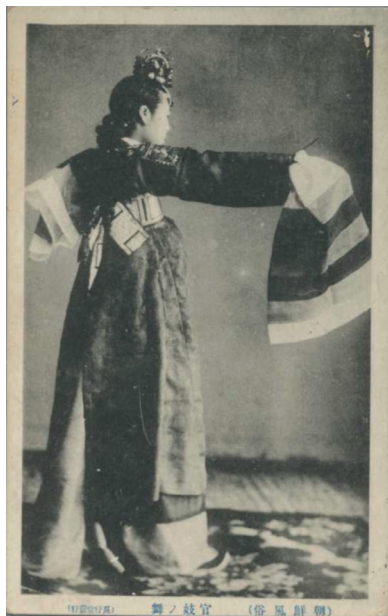
Figure 9 Anonymous, A Government Kisaeng in Dancing Posturing . Colonial period, Korea. Photography postcard.