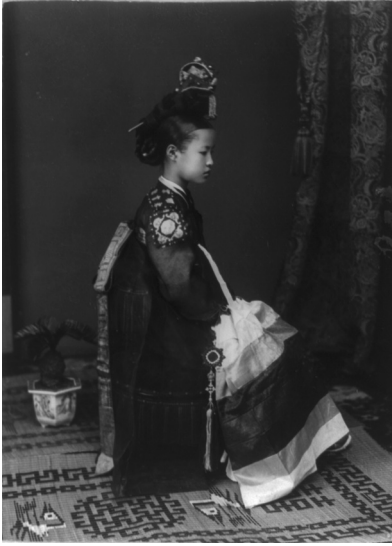
Figure 7 Anonymous, A Seated Government Kisaeng . c. 1894 or 1908. Black and white photographic print.