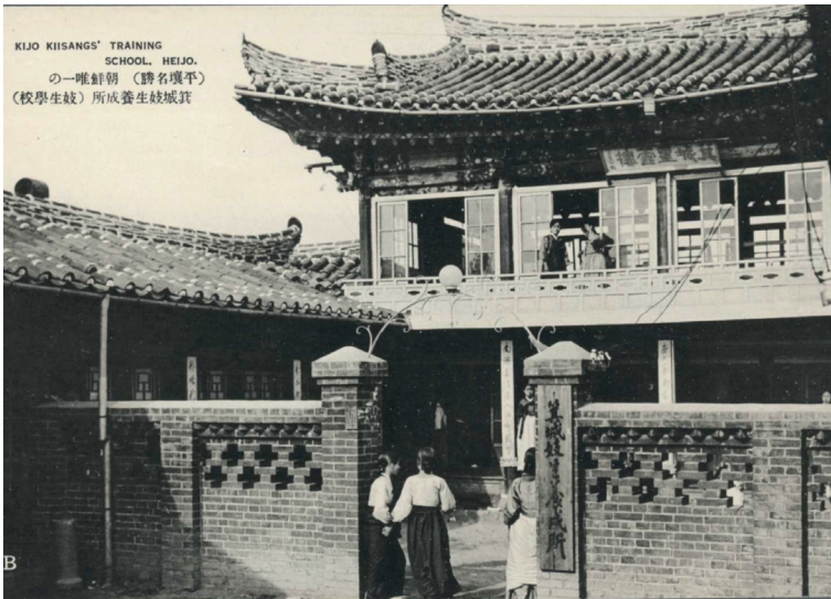
Figure 12 Anonymous, The Kisaeng School . Colonial period, Korea. Photography postcard. Collection of Yamamoto Shunsuke, Kyoto. © International Research Centre for Japanese Studies, Kyoto, Japan

For example, Chōsen Jingū (built in 1925), a Shinto shrine in Seoul for worshipping the Japanese emperor Meiji Tennō that was built in 1925 during the Japanese occupation, was represented in kisaeng postcards. Figure 13 combines a photograph of Chōsen Jingū and a photograph of a young kisaeng in hanbok surrounded by Korean drums [fig. 13]. Such a union of two originally unconnected subjects blurred the boundaries between place and the human figure, Japan and Korea, new and old. By establishing kisaeng as tour guides and a tourist attraction of colonial Korea, the Japanese transformed the subordinated female bodies of kisaeng into embodiments of their Korean colony.