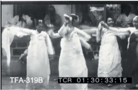
Figure 3ab Burton Holmes, Official Kisaeng at the Palace . 1901. Seoul, Korea. Two shots from the 35 mm film footage about Korea. The Travel Film Archive

rea, I postulate that the one-minute clip (from 3'30" to 4'36"), which features dancing girls, was a rare encounter made fortuitously when the kisaeng were practising in the palace. At the beginning of the clip, Holmes shows the faces of several young kisaeng [fig. 3a], which parallels the focus on kisaeng 's faces in his textual descriptions. He writes that they "are sometimes pretty", "with faces powdered and made up" (108). The rest of the clip showed the kisaeng dancing with musical accompaniment from the male musicians sitting in the back [fig. 3b]. The ease of the facial expressions and movements of the kisaeng reveals that when Holmes was holding his camera and shooting the scene, they were merely practising or warming up rather than performing on a formal occasion. Meanwhile, corresponding to Holmes's observation in the Travelogues that kisaeng were "always immaculately dressed" (108), most of the kisaeng in the footage were dressed in white or light-coloured hanbok with their hair neatly bound up in a similar style.