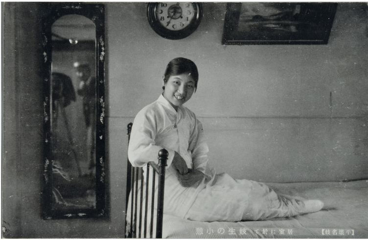
Figure 16 Anonymous, A Kisaeng Resting on a Bed . Colonial period, Korea. Photography postcard. Busan City Museum.

Within the framed pictorial space on portable postcards, kisaeng were not only established as icons of traditional Korean culture but also staged to embrace and assimilate 'Western' elements through the objects surrounding and on their bodies.