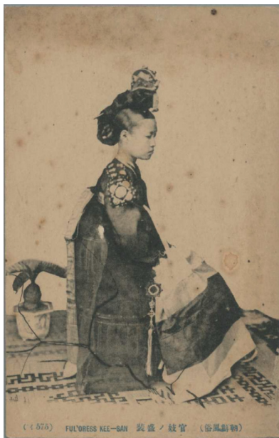
Figure 10 Anonymous, A Government Kisaeng Dressed Up . Colonial period, Korea. Photography postcard. Collection of Yamamoto Shunsuke, Kyoto. © International Research Centre for Japanese Studies, Kyoto, Japan

and a tourist attraction for actual and potential Japanese tourists. When opening a Korean railway map published by the Railway Bureau of the Government-General of Chosen [Chosŏn], the image of a beautiful kisaeng might have appeared as an alluring welcome. 17 Postcards, as an affordable means of attracting tourists, were manufactured to show Japanese the tourist attractions to be found in their Korean colony. It was a common practice to combine kisaeng photographs and scenic views of Korea. Titles such as A Hundred Views of Keijo [Seoul] (Keijō Hyakkei 京城百景) and The Fifty Scenic Views of Heijo [Pyongyang] (Heijō Gojikkei 平壤五十景) were printed on kisaeng picture postcards, establishing kisaeng in the role of introducing and representing Korea. A beloved tourist experience was a boat tour along the Taedong River (Taedonggang 大同江) in Pyongyang accompanied by kisaeng and their entertainment service. Some postcards present a mixture of kisaeng , boat tours, and Japanese tourists. A number of other postcards