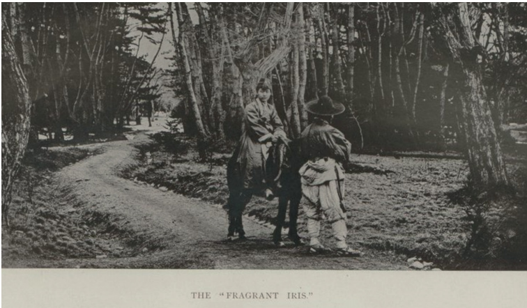
Figure 1 Percival Lowell, The Kisaeng 'Fragrant Iris' in a Winter Landscape . 1884. Albumen print, 28 × 36 cm. Photograph.