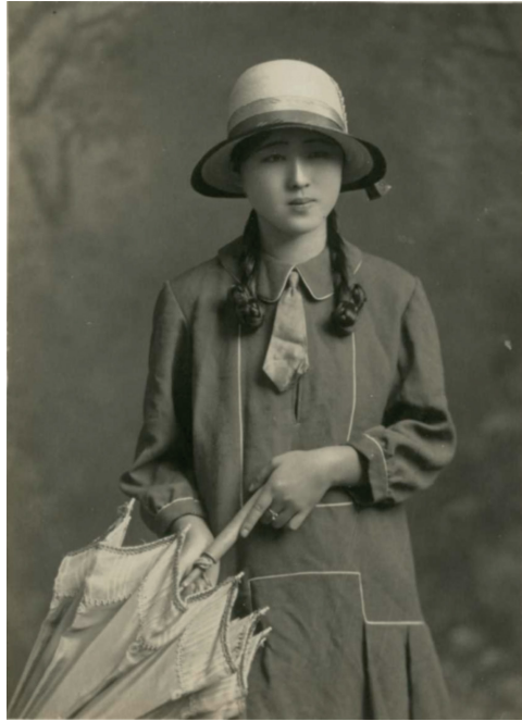
Figure 17 Anonymous, A Kisaeng in Western-Style Suit Holding an Umbrella . Colonial period, Korea. Stamped date (on its backside): 10 May 1932. Photography postcard, 10.8 × 8.2 cm. Collection of Yamamoto Shunsuke, Kyoto. © International Research Centre for Japanese Studies, Kyoto, Japan

Western-style attire and Korean hanbok . Kisaeng on postcards with stamped dates in the 1900s already incorporated certain ‘Western’ elements, e.g. Western-style hats, in their costumes. It implies that kisaeng might have led the embrace of Western-style clothing and hairstyles, at least on the mass-produced postcards. On a picture postcard with the stamped date May 10, 1932 [fig. 17], the kisaeng eschewed Korean dress for Western-style clothes, hairstyle, and accessories from top to bottom: a high-crowned and wide-brimmed hat, curled hair, one-piece dress decorated with a tie, and a laced umbrella. 18 It is also worth noting that in the numerous widely-circulated kisaeng photographs, Japanese producers did not seek to replace traditional Korean attire with the Japanese kimono (though some kisaeng wore the kimono ) but represent traditional Korean dress or the new Western style.