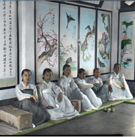
Figure 5 Burton Holmes, Kisaeng Seated in a Room with Bird-and-Flower Paintings and Calligraphy , 1901. Hand-painted 3.5 × 4 inches glass lantern slide.

ed Holmes' personal perceptions and feelings about kisaeng . From the perspective of using visual materials as historical resources, it is worth noting that Holmes provided valuable first-hand visual resources that documented the lives and performances of kisaeng at the court in 1901 Seoul before the government kisaeng ( kwan'gi 官妓) system was officially banned in 1908. 10 These works represent a unique viewpoint visualizing kisaeng in everyday life with more randomness and spontaneity. They are distinct from the numerous staged or highly performative photographs of kisaeng (often smiling) produced in photography studios or outdoor settings that were printed as postcards and other illustrated products by Japanese publishers.