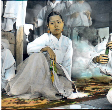
Figure 4 Burton Holmes, A Kisaeng Seated with a Folding Fan . 1901. Hand-painted 3.5 × 4 inches glass lantern slide.

a white top and grey skirt, seated on a floral-patterned carpet and resting her right hand, which holds a green folded fan with tassels, on her knee. She calmly looks directly into the camera, which suggests her awareness of Holmes and the fact that she was being captured by the camera [fig. 4]. She was surrounded by other figures. To her right, another seated figure pinching a similar green folded fan with her hands is partially visible. They were probably both at dancing practice. This photograph is a rare close-up documentary image of the interior space for kisaeng 's regular practice, possibly at court.