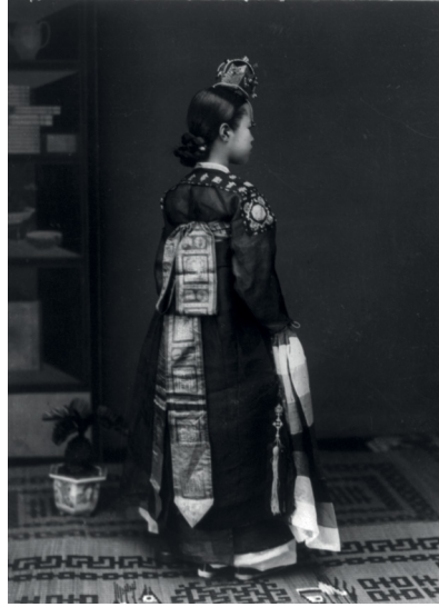
Figure 8 Anonymous, A Standing Government Kisaeng . c. 1894 or 1908. Black and white photographic print.

photo studio and printing business in Korea (Lee 2014). It was only in 1907 that the first photo studio, likely run by Koreans, Ch'önyöndang Photo Studio 天然當, opened, marking a turning point in the history of Korean photo studios and photography. A rapid increase in Korean-run photo studios soon followed (Lee 2014). Kisaeng were indeed ‘public women’ in Chōson society who could be visible in public. They were not required to cover their heads and bodies with long clothing as was the case for gentry women. As both Hulbert’s and Carpenter’s kisaeng photographs show, the staged settings in photo studios rather than on the street or in an open-air background indicate that they likely were photographed in Japanese-run photo studios and sold on the market, probably targeting both ‘Western’ and Japanese travelers in Korea. They were printed on a higher quality paper stock than the one used for the later Japanese postcards from the colonial period. It suggests a higher price point than the affordable mass-produced picture postcards. Perhaps because they were products of the Japanese-run photo studios, the government kisaeng photographs from the collections of Hulbert and Carpenter were later reproduced by Japanese publishers on picture postcards in the colonial era [figs 9-10].