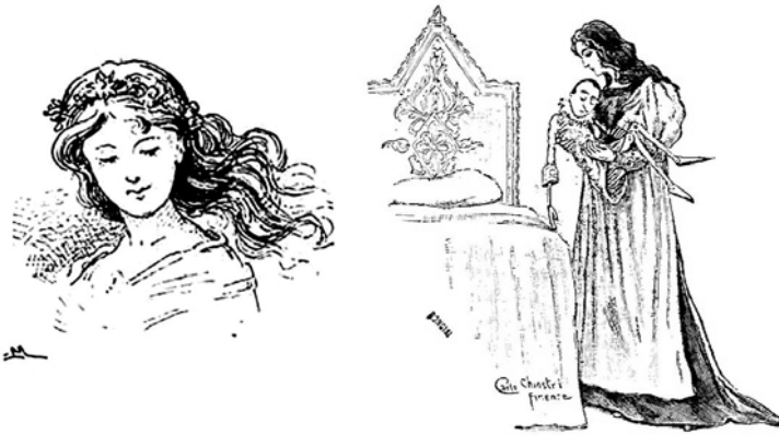
Figure 1 Enrico Mazzanti, illustration for Collodi, C. (1883). Le avventure di Pinocchio . Firenze: Felice Paggi. Public domain