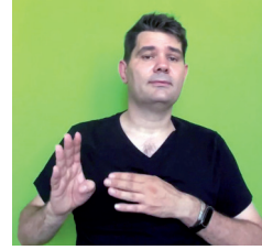
(27) a. CL(B): ‘skate with roller skates’