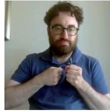
b. CL(closed 5): ‘saw’

In the aforementioned examples, a V root unspecified for the handshape is simultaneously combined with an affix, represented by the instrumental classifier handshape. Because the incorporated Instrument is a classifier, it selects a salient property of a class of entities. This class may vary in size: it could entail a single instrumental item, or more. Below, we show examples of different classifier handshapes referring to Instrument sets of different sizes. The first case is that of classifier handshapes entailing a single instrumental item. For example, the V handshape (extended index and middle fingers) combined with a ‘cutting’ V root only refers to scissors.