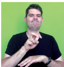
(29) a. CL(U): ‘go up spiral stairs’

Table 3 shows two main patterns, as already observed with default verbs. On the one hand, a few open verbs in Italian correspond to shadow verbs in LIS (4/15 open verbs). This means that signers are required to choose among different classifier handshapes specifying the instrumental items. For example, the Italian open verb salire ‘to go up’ does not have an equivalent open verb in LIS. Signers must make explicit reference to the instrumental item used to go up (e.g., regular stairs, spiral stairs, escalator, elevator, car, bike, etc.), as in (29).