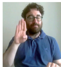
b. CL(B): ‘go up by a four-wheel vehicle’

For other verbs, LIS offers two options (11/15 open verbs): signers can either use an open verb, as in Italian, or specify the Instrument through a particular classifier handshape (shadow realization). One such case is venire ‘to come’, which can be expressed in LIS by the lexical verb COME (open verb) (30a), or by several forms of incorporated Instruments, e.g., the equivalent of ‘come on escalator’ (shadow verb) (30b).