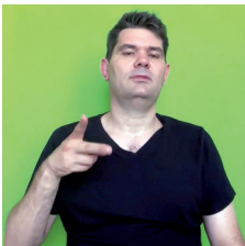
(20) CL(V): ‘cut with scissors’ \implies INST: scissors

In the aforementioned examples, a V root unspecified for the handshape is simultaneously combined with an affix, represented by the instrumental classifier handshape. Because the incorporated Instrument is a classifier, it selects a salient property of a class of entities. This class may vary in size: it could entail a single instrumental item, or more. Below, we show examples of different classifier handshapes referring to Instrument sets of different sizes. The first case is that of classifier handshapes entailing a single instrumental item. For example, the V handshape (extended index and middle fingers) combined with a ‘cutting’ V root only refers to scissors.