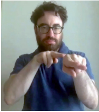
(28) a. CL(U): 'shoot with a rifle'