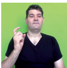
(30) a. COME

For other verbs, LIS offers two options (11/15 open verbs): signers can either use an open verb, as in Italian, or specify the Instrument through a particular classifier handshape (shadow realization). One such case is venire ‘to come’, which can be expressed in LIS by the lexical verb COME (open verb) (30a), or by several forms of incorporated Instruments, e.g., the equivalent of ‘come on escalator’ (shadow verb) (30b).