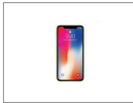
Figure 1 Picture naming task (target: SMARTPHONE)

Both informants participated in two elicitation sessions guided by one of the authors of this paper, who is a hearing fluent signer. To avoid memory bias, the two sessions were at least two weeks apart. The first session included two different tasks: a picture naming task aimed at eliciting 45 Instruments in LIS [fig. 1], and an elicited translation task in which the informants were asked to translate into LIS a battery of 45 Italian verbs presented one by one in written form [fig. 2].