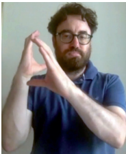
c. CL(curved open 5): 'shoot with a bazooka'