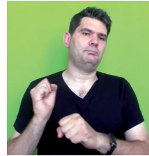
(18) a. CL(L): ‘dry one’s hair with a hairdryer’ b. CL(closed 5): ‘sweep with a broom’

As mentioned above, the informants were allowed to provide multiple renditions for the same item. In a few cases, the informants offered both a whole-entity classifier translation and a handling classifier translation for the same Instrument. For example, ‘to saw’ has two possible versions in LIS: a predicate including a whole-entity classifier (19a), or a handling classifier (19b). Further work needs to be carried out to establish whether these are cases of true optionality, or the choice of the classifier is driven by specific factors.