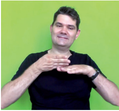
(19) a. CL(B): ‘saw’