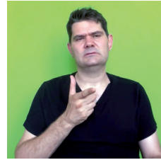
b. CL(L): 'shoot with a gun'