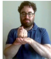
d. CL(G): 'shoot with a cannon'

In other cases, Instruments in LIS may be expressed through a specific classifier handshape, but a default verb is also available (8/15 default verbs). For example, the verb EAT is a default verb, since it is compatible with all the instrumental items that can be used to eat. LIS signers could also opt for a shadow verb to express the Instrument in an explicit way (e.g., eating with the fork, with the spoon, with the hands, with chopsticks, etc.).