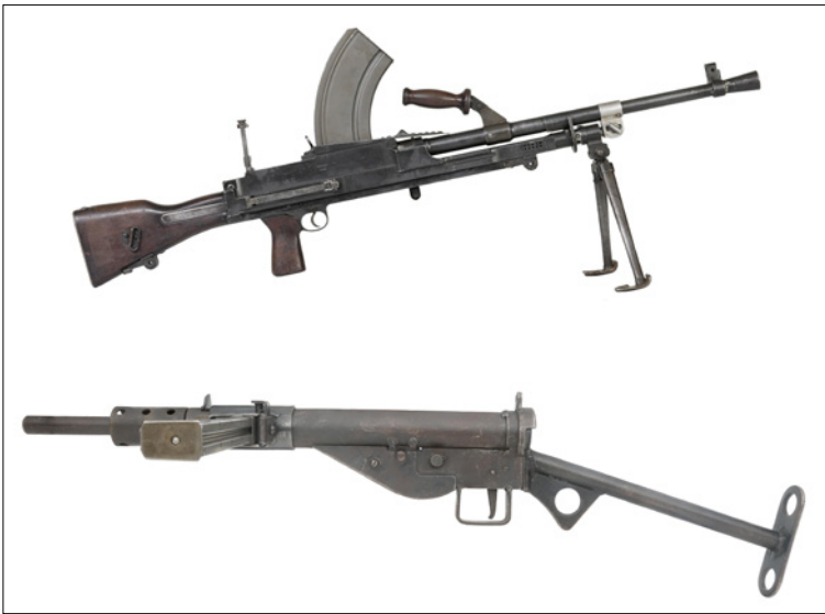
Figure 15 Example of a Bren gun: BREN Mark 2 gas operated/tilting bolt machine gun, manufactured by Enfield, UK.