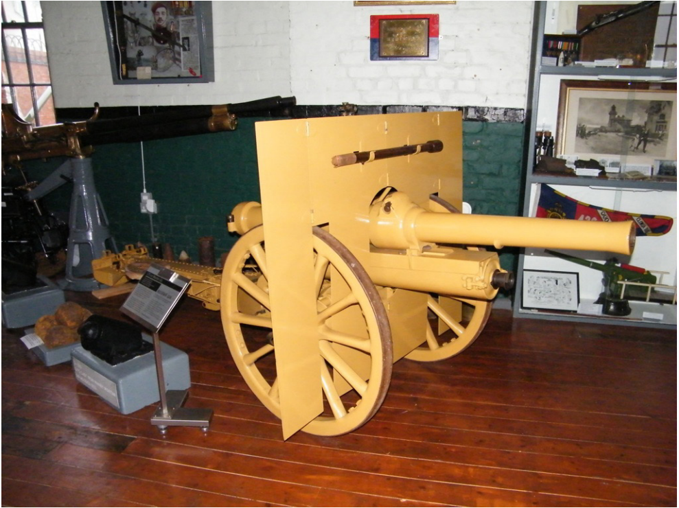
Figure 18 Example of an Ordnance BL 2.75-inch mountain gun (Heugh Battery Museum, Hartlepool, UK, CC BY-SA 3.0)

In October 1944, the Trapchi regiment ( grwa bzhi kha dang dmag sgar ) was receiving instruction in the Ordnance BL 2.75-inch mountain gun (see [fig. 18]) from the Bodyguard regiment, who had learned its operation from the British in Gyantse and Lhasa early in 1944. 185