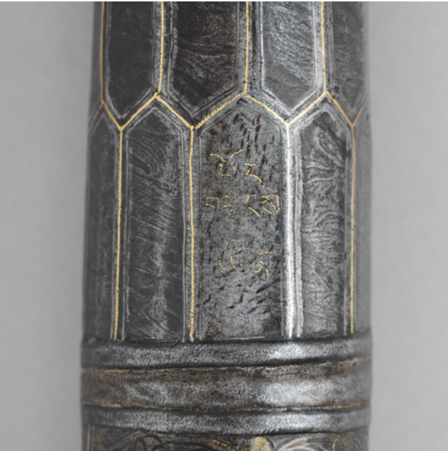
Figures 1-2 Breech area and detail of gold-inlaid Tibetan inscription on a musket barrel. Tibetan. Ca. eighteenth-nineteenth century. Iron, gold, and silver; overall length. 46 1/8 in. (117.2 cm);.65 caliber (17 mm).