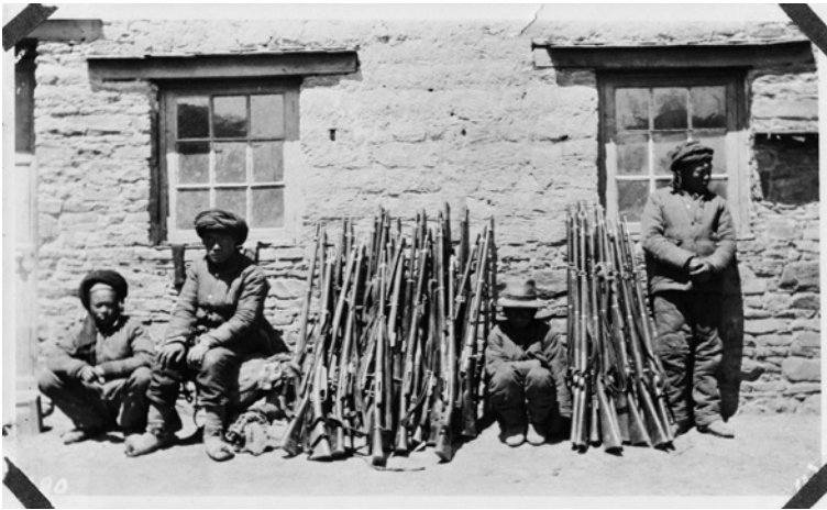
Figure 9 “Chinese and arms captured by Tibetans, 1910-11”.

regarding the same episode, that the Tibetan government stored the weapons seized from the Chinese including “rifles ( me mda' ), machine guns ( me shin 'gan ) and Lewis guns ( lu se 'gan )”. 120 What happened to these first generation machine guns is not entirely clear, as they are not quoted in other sources after 1912 121 and the import, much later, of Lewis guns from British India would then be presented as an additional innovation. In any case, after the end of the Chinese protectorate in Tibet, it was thanks to the new rapprochement with British India that a new chapter in firearms import began.