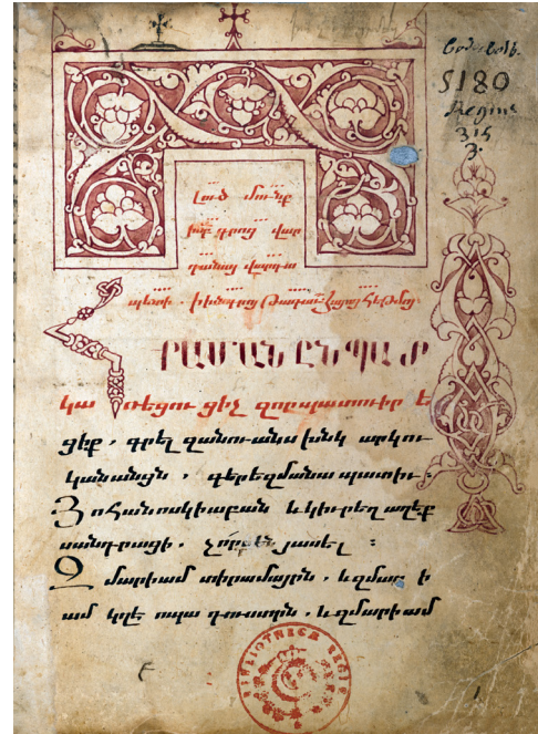
Figures 4-5 The opening folio of Vardan Arewelc'i's compendium, with marginal note on the left hand side. BnF MS Arménien 42, 1r

Significantly, Vardan seems to have intended the Žłlank' to aid the king in the study of other manuscripts at the royal library. The Žłlank' includes, for instance, an extensive set of pictographs that stand for common terms one encounters in Armenian manuscripts, ranging from patriarchs in the Hebrew Bible such as Abraham to a variety of Armenian names, as well frequently used words like 'musician', 'heaven', 'Egypt', 'world' and 'money'. Many of these abundant pictographs function in the Armenian manuscript record essentially as commonplace