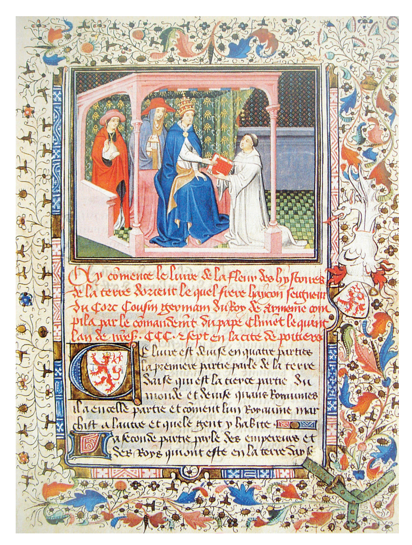
Figure 2 Het'um the Historian's presentation of La Flor des estoires de la terre d'Orient to the Pope. BnF NAF 1255. 1r

and from Outremer French (in the transference of juridical knowledge), reaching both eastward and westward in the entwined labour of producing knowledge, cultivating language, and pursuing the aims of the kingdom. These early authors of Cilician Middle Armenian straddled multiple cultural and linguistic worlds, and these experiences shaped the early corpus of vernacular Armenian texts in a profound way.