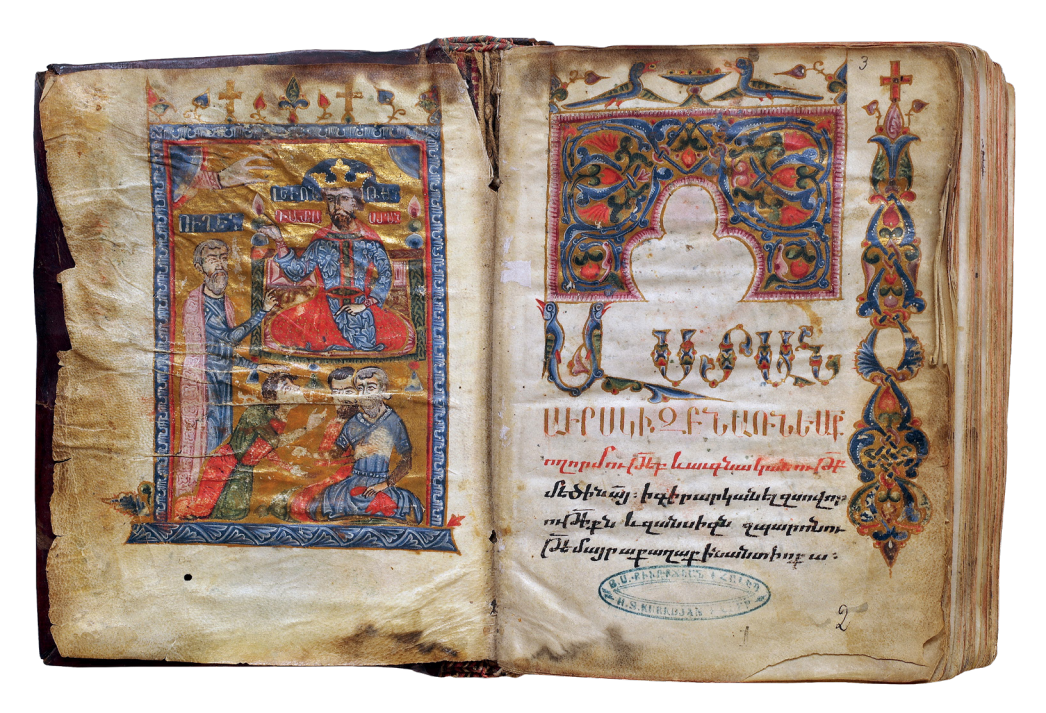
Figure 1 The frontispiece of Smbat Sparapet's Middle Armenian translation of Assises d'Antioche. V107, 1v-2r. Mekhitarist Order, San Lazzaro, Venice.

King Lewon into the conduit through which divine judgment is meted out on earth [fig. 1]. The implication, in this case, is that such judgment is also mediated through the 'vulgar' text of Smbat's translation, which is also constitutive of the court's adjudicating power. The image, like the translation from one 'vulgar' tongue to another, underscores a form of divinely-appointed Armenian authority claimed and exercised by the royalty through the production of vernacular texts.