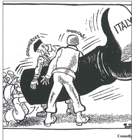
Image 1. The Star (Johannesburg, Transvaal). Monday, September 4th 1939, 11