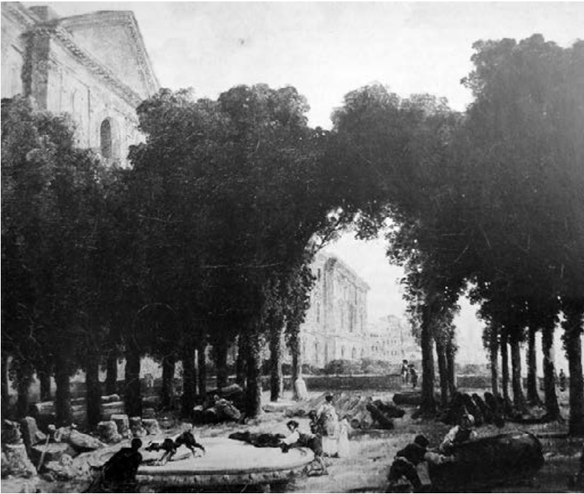
Fig. 5. Hubert Robert, Entry to the Musée Napoleon , particular collection.