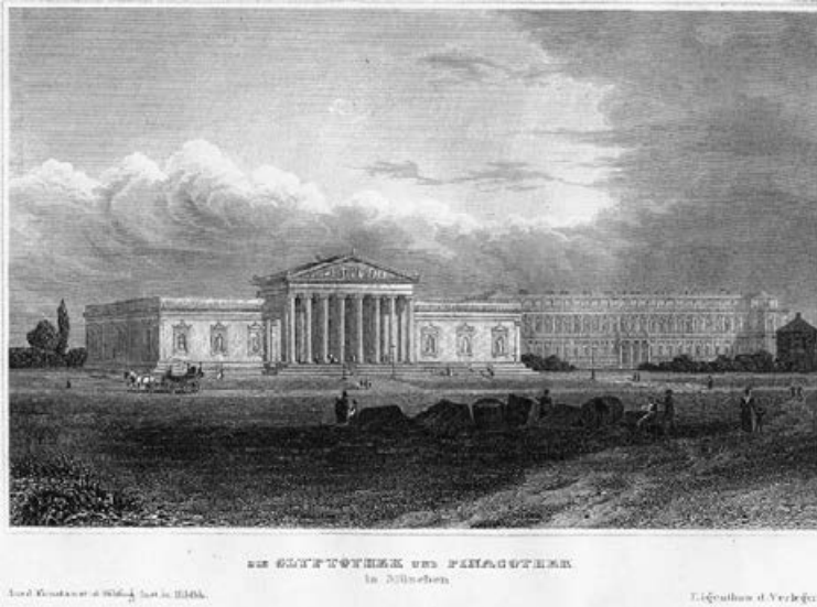
Fig. 10. Romantic view with antique ruins in front of the Munich Glyptothek, where they never existed. Anonymous German print, private collection.

statues and fountains decorated the surrounding Sal6n del Prado, but it was never contemplated to put some antiquities from the museum collection outdoors.