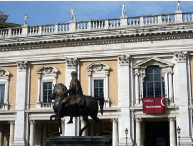
Fig. 1. Equestrian statue of Marcus Aurelius in the middle of Piazza Campidoglio, in front of the Capitoline Museum, Rome.