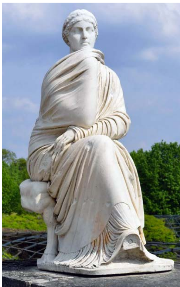
Fig. 7. Roman statue called Mnemosyne which used to be in the gardens by the entrance of the Louvre Museum, nowadays in the Park of Compiègne Palace.

Such recurrent use of classical statuary in monumental proposals for the artistic epicentre of Paris was in tune with political propaganda praising the French capital as a new Rome, the head of a vast military and cultural empire. Another site which also gained new relevance was the large esplanade between the Louvre and the Tuileries, which had been the favourite stage for many Republican ceremonies (Poulot 2004, p 125). The ambitious and highly symbolic project of a monumental fountain never came to fruition. The plan was to reuse the Lion of the Piazzetta San Marco brought from Venice as its base, crowned by elements from historical French statuary; but the horses from Saint Mark were relocated there from 1802 to 1807 on tall plinths (Fig. 8). 22 The Musée Napoleon and its surrounding urban space had thus become an emblematic public setting at the service of Bonaparte's cult. But blatant propaganda had also to be met by public ornamental iconography outdoors mixed with Roman antiquities,