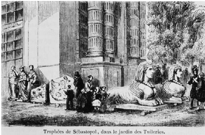
Fig. 11. Antiquities from Sebastopol's war booty on public display by the Orangerie des Tuileries, Paris. Anonymous illustration published at the journal L'Ami de la Maison on 3rd July 1856.

In London, this trend reached its momentum around the British Museum, which became the focal point from which the Grecian revival would spread across a burgeoning maritime metropolis then branded as «the new Athens» (Jenkins 1992). The marble pieces from the Parthenon had an immediate aesthetic influence on new monumental buildings in the urban district of Bloomsbury, where the emulation of Greece had an impact on the pastiche of the Erechtheum with the caryatides before the façade of St Pancras New Church, built in 1819-1822 in Neo-Greek style, as well as on the friezes of University College or the columns of Russell Institution. Eventually, the apex was marked there by the grandiose neo-Grecian building for the new headquarters of the national museum and library commissioned from Robert Smirke, but he made no plans to install sculptures in the surrounding gardens. Some antiquities were provisionally stored in the portico, though professionally sheltered in boxes, unexposed to weather or vandalism.