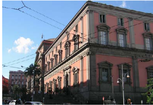
Fig. 9. Stairs and terrace at the main entrance of the National Museum of Archaeology, Naples, where it was decided not to place anything from the collection.

Even longer was the delay in the realisation of the museum project conceived by the same Charles of Bourbon in Madrid, once crowned as king of Spain. Instead of housing it in his new Royal Palace, which would have been the easiest and most regal option, he chose to place it on a meadow at the far end of the city, next to the Buen Retiro gardens. These he had had opened to the public on condition that visitors came clean and properly dressed. Located on a suburban hill - like mount Akademos in Athens -, Charles III promoted there the creation of the Astronomical Observatory, the Botanic Garden and what was originally intended to be the Museum and Academy of Natural Science. This neoclassical triangle formed a 'Hill of the Sciences' bizarrely removed from the seats of political, religious and university power (Vega 2010). However, the Prado was opened by Fernando VII in 1819 as the Royal Museum of Painting and Sculpture, with its façades appropriately decorated as a 'temple of the arts'; yet none of the valuable ancient statues owned by the king were placed then outdoors, which was a sensible decision given that children repeatedly threw stones to the plaster sculptures provisionally installed in 1833 to decorate the façade on the occasion of Infanta Isabel's swearing the oath as heirress to the throne in a nearby church. 27 Neoclassical