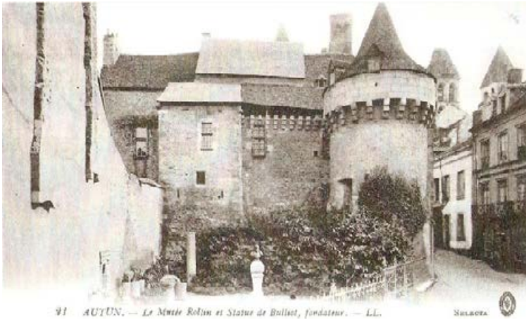
Fig. 12. Antiques placed as decorative background to the bust of archaeologist Gabriel Bulliot, founder of the Museum Rollin in Autun (France). Anonymous photo dated during World War I (vintage postcard).

vestibule of the nearby Museum of Living Artists. 31 This dominant trend had obviously some exceptions and setbacks, notably in the case of Louis Napoleon Bonaparte, always so eager to emulate Napoleon's era. The spoils brought from Sebastopol could only partially be housed at the Louvre and were therefore displayed from 1856 to 1857 at the Orangerie des Tuileries, whose entrance was then decorated with five antique sculptures of the Muses 32 (Fig. 11).