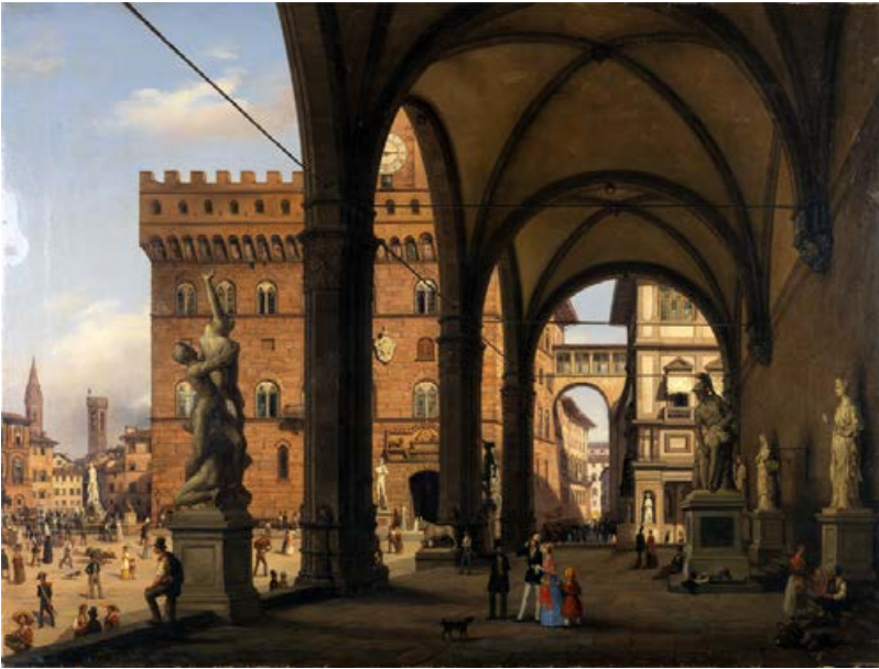
Fig. 4. Carlo Canella, Loggia della Signoria , 1847. Collection Cassa di Risparmio Firenze.

is not surprising that his successors also used the loggia as a socio-spatial intersection in the public display of the art treasures of the dynasty: they made of it a preamble to the Uffizi while it also constituted a continuation of the main citizen square.