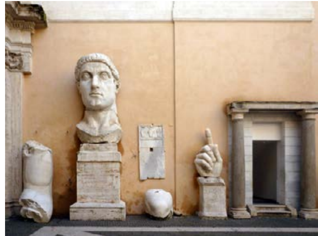
Fig. 2. Antiquities displayed at the courtyard of the Palazzo dei Conservatori, a public area preceding the access to the Capitoline Museum, Rome.

the stately halls undoubtedly added to the allure of the gallery for social parvenus . Nonetheless, most commoners had to be content with being allowed access to the gardens, courtyards and other areas on the ground floors peopled by servants.