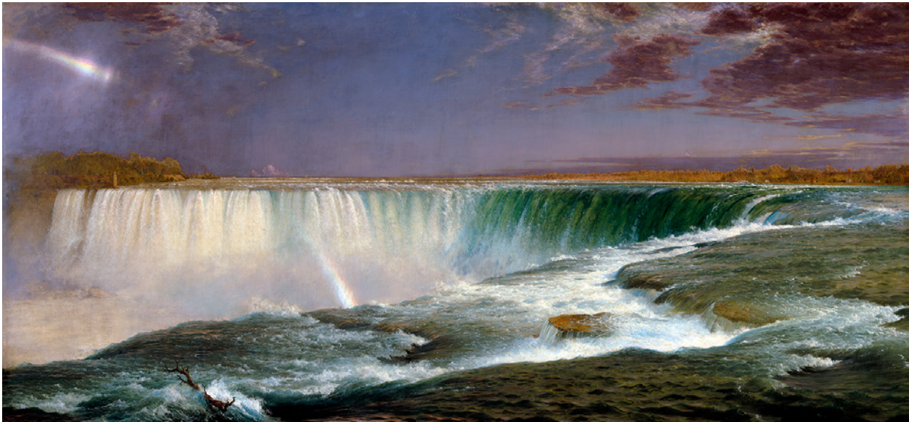
Figure 1. Frederic Edwin Church, Niagara , 1857. Oil on canvas; 101.6 × 229.9 cm (40 × 90 1/2 in). National Gallery of Art, Washington, D.C.: Corcoran Collection (Museum Purchase, Gallery Fund)

zation, commerce, and customs. Just in November of the previous year Abraham Lincoln was elected President of the United States of America and he guided the country through this internal war and a political crisis, ultimately defeating the Confederate States of America and preserving the Union. The southern states were just starting their long reconstruction when President Lincoln was assassinated, on April 15, 1865.