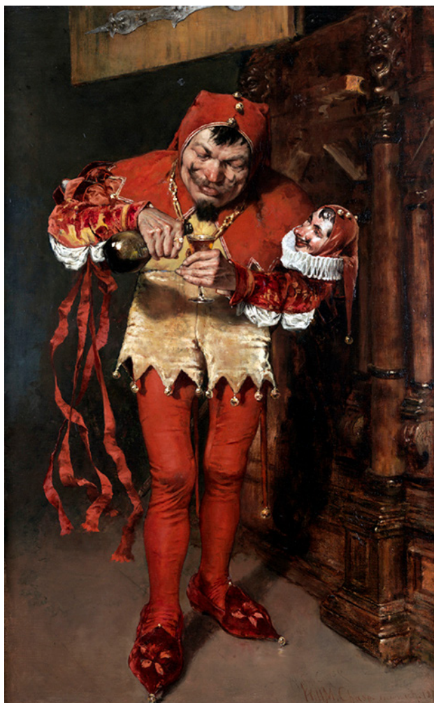
Figura 7. William Merritt Chase, 'Keying up' - The Court Jester , 1875. Oil on canvas; 101 × 63.5 cm (39 3/4 × 24 in).

only three years after the Paris exhibition, whose initial collection was a private donation of more than 150 paintings, all by European artists.