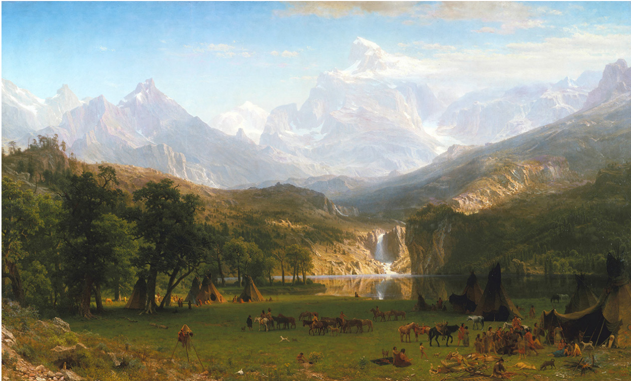
Figure 2. Albert Bierstadt, The Rocky Mountains, Lander's Peak , 1863. Oil on canvas; 186.7 × 306.7 cm (73 1/2 × 120 3/4 in). The Metropolitan Museum of Art, New York: Rogers Fund, 1907

American people of an international event on European soil and about the need of a government support. The French Imperial Commission, which oversaw the event, compiled a classification of 10 categories subdivided into 95 classes, that every participating country had to follow. Fine Art 4 was the subject of the first group. 5