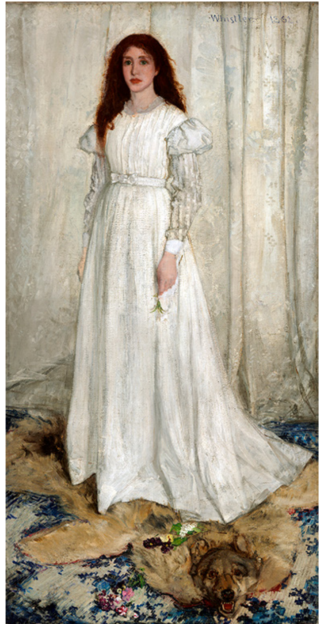
Figura 3. James McNeill Whistler, Symphony in White, No. 1: The White Girl , 1862. Oil on canvas; 213 × 107.9 cm (83 7/8 × 42 1/2 in). National Gallery of Art, Washington, D.C.: Harris Whittemore Collection

The American exhibition included few historical compositions, an exception were Winslow Homer's paintings of the Civil War. Homer's activity as artist-correspondent during the conflict provided him subjects for his paintings. The Bright Side , depicting a group of African-Amer-