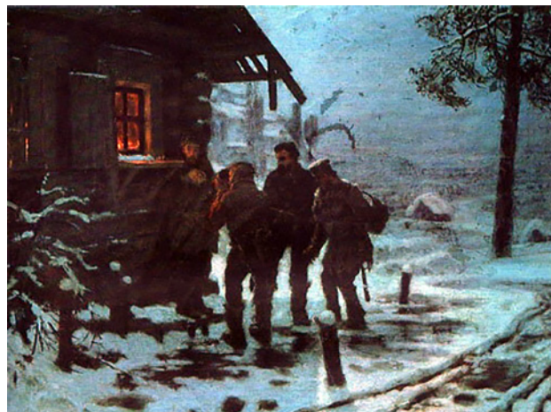
Figure 4. Konstantin Savitsky. Alms for the Sake of Christ, 1891-1892. Regional Art Museum in Irkutsk.

This could perhaps clarify the choice of paintings, which were provided with comments in the English version of a Russian general catalogue – thirteen paintings created during the previous decade by quite well-known artists in Russia. The subjects could have been unclear to foreigners – Korzukhin’s The Brides Evening Party , Novoskoltsev’s The Last Moments of the Metropolitan Philip , Miassoyedov’s Flight of Grigory Otrepiev From a Tavern on the Frontier of Lithuania and others. Most of the paintings depicted historical events or national customs, but two paintings were about the current social situation in Russia: An Arbitrator of Peace (fig. 3) 11 by Nikolay Kusnetsov (1850-1930) and Alms for the Sake of Christ (fig. 4) by Konstantin Savitsky (1844-1905). The first one was about the abolition of serfdom in Russia (in 1861), which set the peasants free on condition that they served