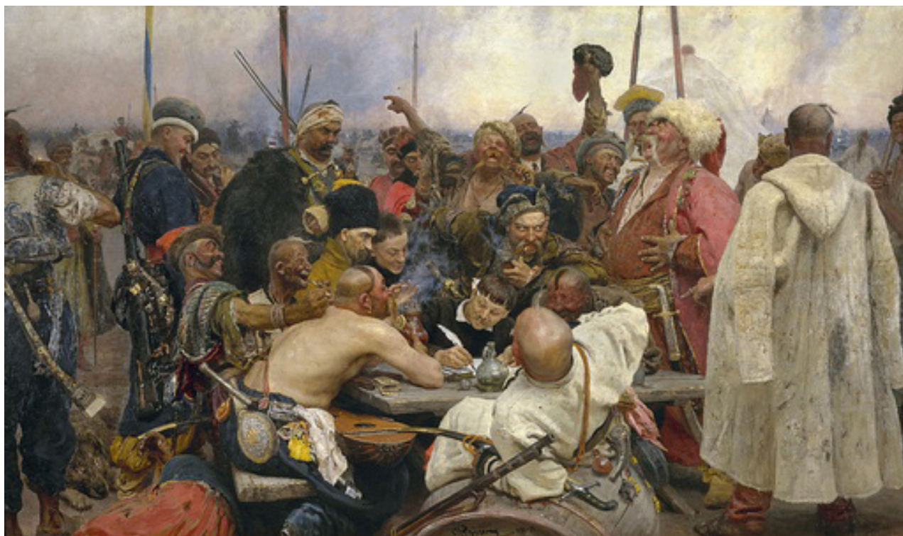
Figure 1. Ilya Repin. Reply of the Zaporozhian Cossacks, 1880-1891. State Russian Museum, St. Petersburg.