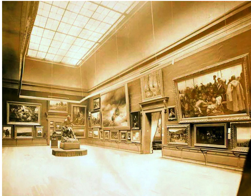
Figure 6. Hall of the Russian section in the Fine arts Palace.

lon art and by 1891 he owned four of Makovsky's paintings, which he described with the rest of his collection in a brochure Art and Gems (1891) and exhibited in New York and other cities. It is considered that Makovsky became famous in America through Schuman. In press during the 1890s Makovsky was shown as a "new Russian genius in art", whose oeuvre proved that "Russia shined in art as in literature" (Plenniki krasoty 2011, 125). However, at the Columbian Exposition, Schuman did not buy any of Makovsky's paintings and all of them were forwarded to the Midwinter International Exposition with the works of Aivazovsky. The fact that the paintings were sent to that exhibition in California showed the attitude towards them as valuable works. The exhibition appeared to be an extension of Chicago's and, according to the concept, only the best items would be selected for it (Smith [2005] 2006, 113). 16