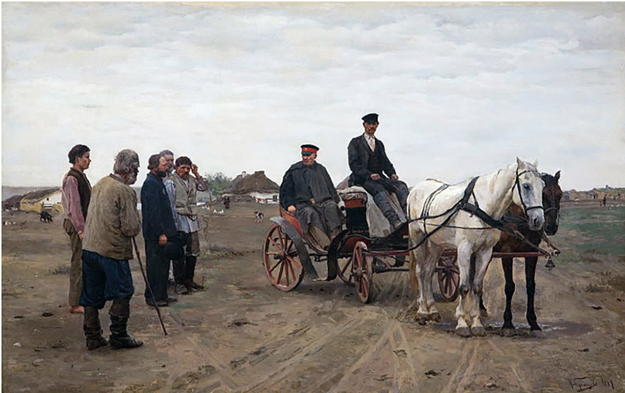
Figure 3. Nikolay Kusnetsov. An Arbiter of Peace , 1888. David Owsley Museum of Art Ball State University.

Knight at the Crossroads . 6 However the owners did not allow it ( Vo glave Imperatorskoj akademii 2009, 246).