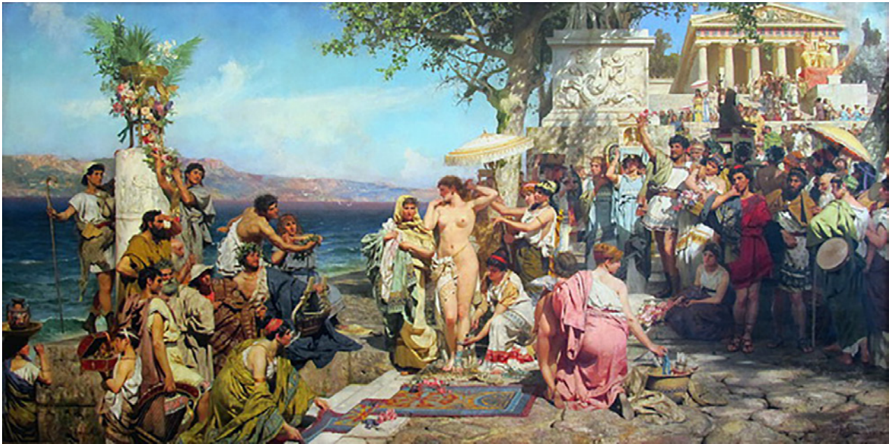
Figure 2. Heinrich Semiradsky. Phryne , 1889. State Russian Museum, St. Petersburg.

(1835-1894), 2 also members of the Peredvizhniki , formed a commission to organize the Russian fine arts collection in Chicago. At the first meeting on the 5th of May 1892 3 they made a list of 65 artists and later sent out invitation letters. It was planned to organize a special exhibition-review in the halls of the Academy. The participants were asked to reply whether they were ready to take part or not, and to deliver the works to the Academy by the 15th of August 1892. The Academy undertook all the further expenses for the chosen works. 4