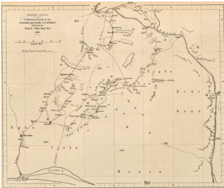
Figure 2 RGS, Yorùbá and Nupe Countries, 1860, Engraving, Royal Geographical Society, London.