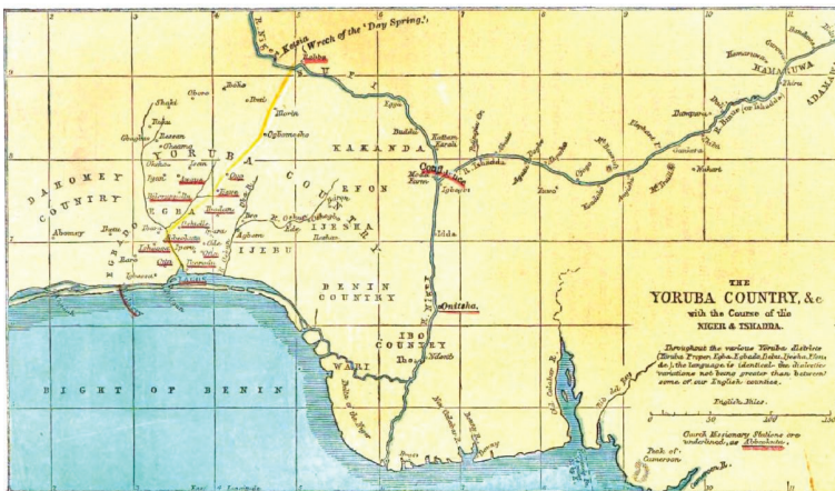
Figure 1 CMS, The Yorùbá Country, with the Course of the Niger and Tshadda 1859, Engraving, The Church Missionary Atlas, CM House, London