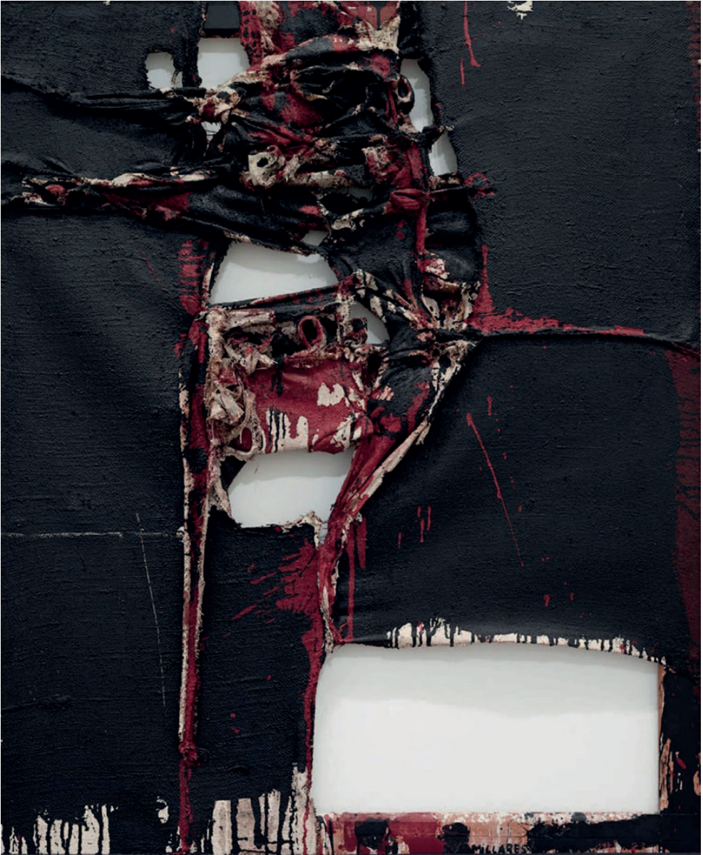
Figure 2 Manolo Millares, Homúnculo . 1960. VEGAP, Madrid, 2016