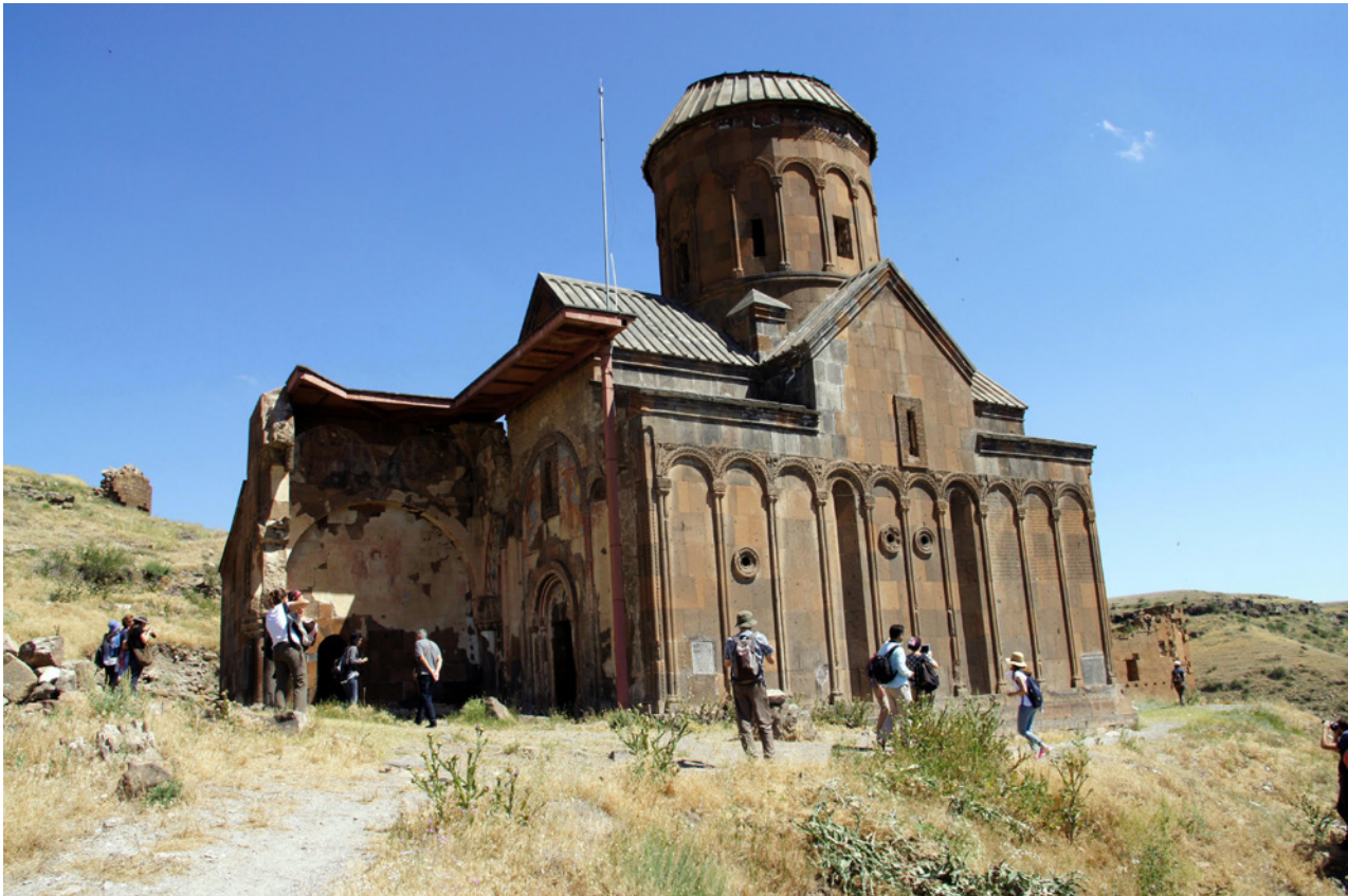
Figure 3. The Church of Tigran Honents' from south.

published text, and because the sentence reads "This small church, which can only hold 40 to 60 people, has three beautiful doors" (emphasis added). 13