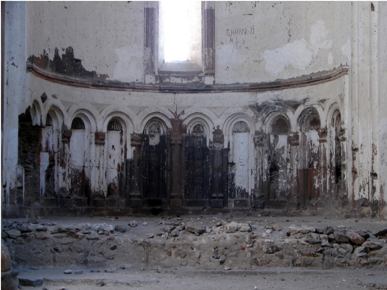
Figure 2. Ani Cathedral, interior towards East.

Balakian's comments on individual monuments demonstrate informed and close observation. For example, he knows the early eleventh-century account of Step'anos Tarōnets'i, which mentions that the church of Gagkashēn was based on the seventh-century church of Zvart'nots' (79). Balakian also notes that the crenellations of the fortifications have largely lost their "comb-toothed points" (սամարագլուխ ցցուածքներ), also barely visible today (22). Regarding Ani Cathedral, Balakian rightfully notes the many cavities in the vaults and arches of the structure, invisible to the naked eye, but verifiable by intrepid climbers (29-30). Finally, he pays attention to interior decoration: at the church of Tigran Honents', he writes, the depictions of the martyr Hrip'simē and her companions are depicted with "such vivid postures