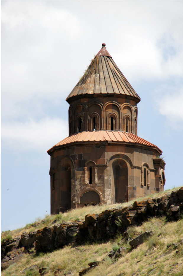
Figure 1. The Church of Gregory from north (Abughamrents').