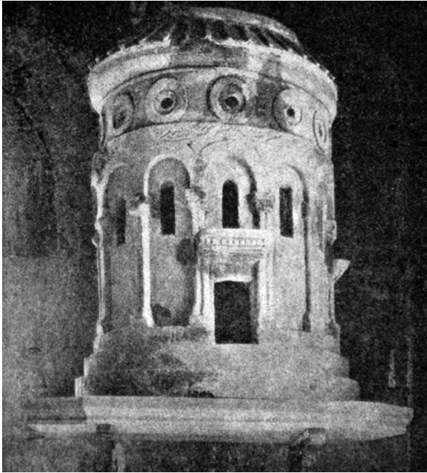
Figure 6. Gagkashēn, stone model unearthed during excavations (now lost). (After Strzygowski, 1918, 55 fig. 72)