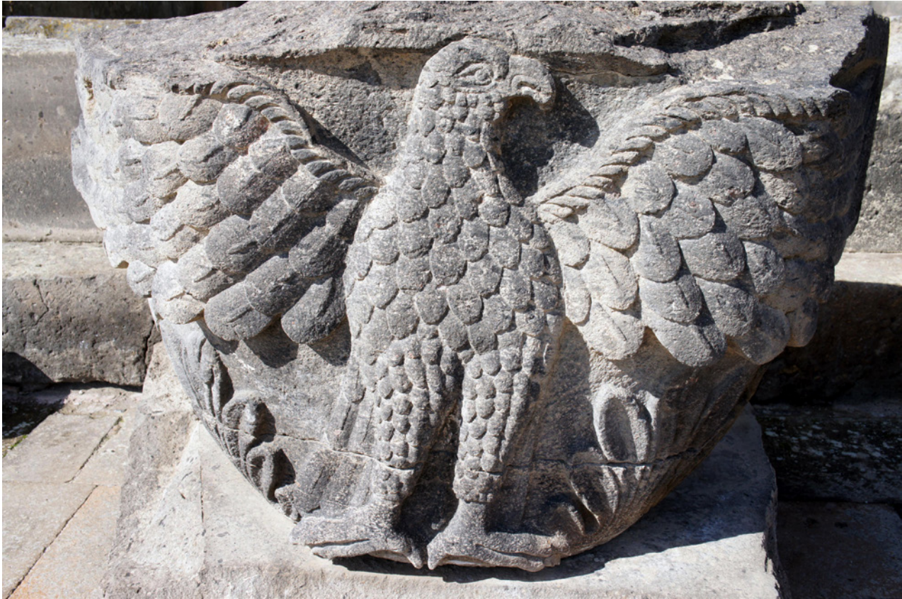
Figure 4. Eagle Capital, Zvart'nots' (Republic of Armenia).

fashion images of flowers and animals on stones. (Balakian 1910, 35) 15