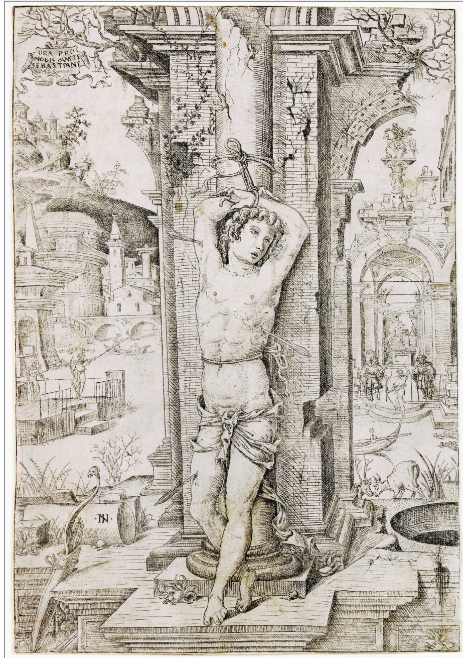
Figure 1 Nicoletto da Modena, St. Sebastian , state 1. ca 1512. Engraving on paper, 295 × 205 mm. Paris, Louvre, Réunion des Musées Nationaux

Deposition from the Cross . 15 Nicoletto's city, with its gateway, obelisks and tower surmounted by a Turkish half-moon, recalls similar backdrops in Mantegna's works that were circulating in prints