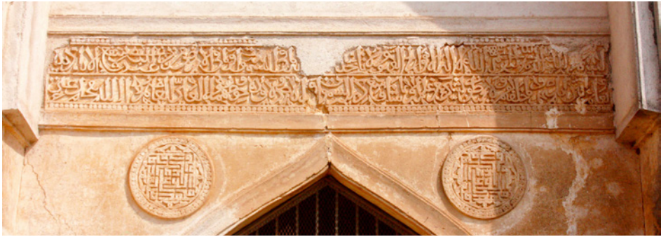
Figure 9. Khalilullāh Kirmāni dargāh, Ashtur (Bidar), external facade of the monumental gateway