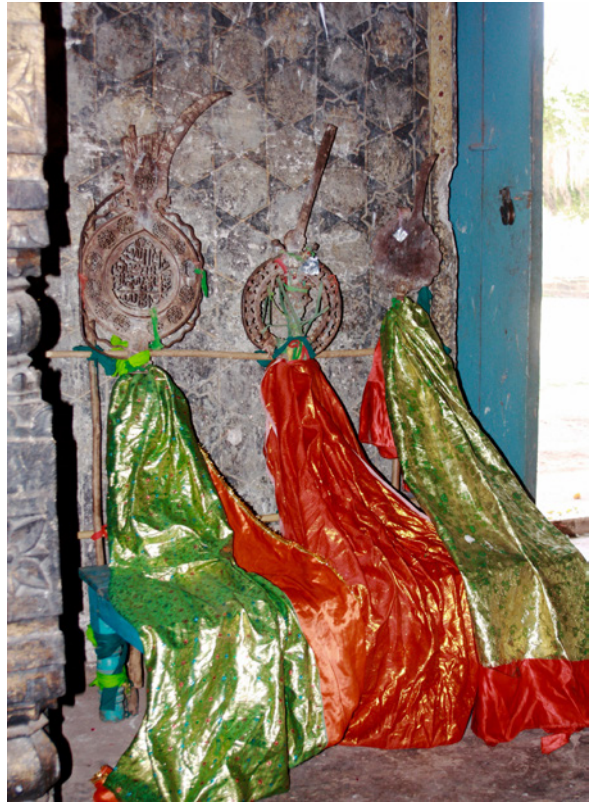
Figure 8. Mausoleum of Aḥmad Šāh I Bahmanī, interior. Three 'alams preserved and still used in occasion of the sovereign's'urs

Although in the case of the mausoleum of Aḥmad Šāh I it is difficult to make out the panjetan in the shape of a tuḡrā described by Yazdani – the above-mentioned hypothesis suggested by Philon (2000, p. 7) seems here more plausible – there is no doubt that the five names play a key role within the decorative scheme of the building. Considering that decorative elements are often hierarchically arranged, it is also significant that the names of the imams of Twelver Shi'a Islam are displayed immediately after those of the Prophet and his daughter Fāṭima, near the centre of the dome. In the Deccan, most inscriptions of this sort were commissioned by the – openly Shi'i – dynasties that followed the Bahmanī within Sufi shrines and family mausoleums, in which case they usually adorn the ruler's cenotaph. Let us think here of the cenotaph of Muḥammad Qulī Qutbšāhis (d. 1602) in the royal necropolis of Golkonda, which combines Koranic inscriptions with an invocation of the twelve imams (Allan 2012, pp. 65-66).