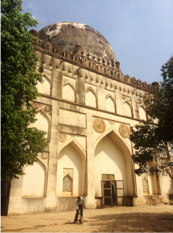
Figure 1. The mausoleum of Aḥmad Šāh I Bahmanī, exterior

of art historians; but despite the high quality of recent research, 3 because of the amount of monuments and their state of disrepair much evidence is still waiting to undergo more accurate and systematic investigation.