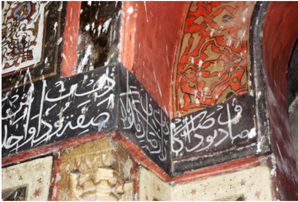
Figure 5. Aḥmad Šāh I Bahmanī mausoleum, interior. Pictorial decoration of the walls, epigraphic bands