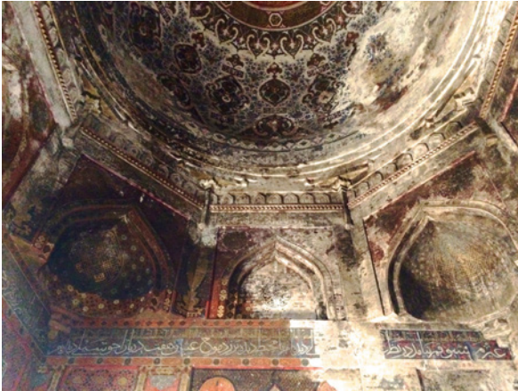
Figure 3. Aḥmad Šāh I Bahmanī mausoleum, interior. Pictorial decoration and its state of preservation