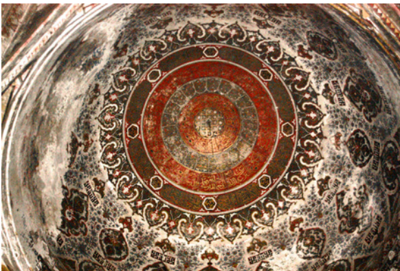
Figure 4. Aḥmad Šāh I Bahmanī mausoleum, interior. Pictorial decoration of the dome