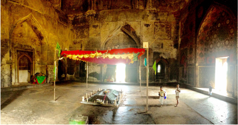
Figure 2. The mausoleum of Ahmad Šāh I Bahmanī, interior