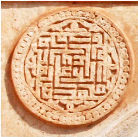
Figure 10. Khalilullāh Kirmāni dargāh, Ashtur (Bidar), detail of the gateway's facade