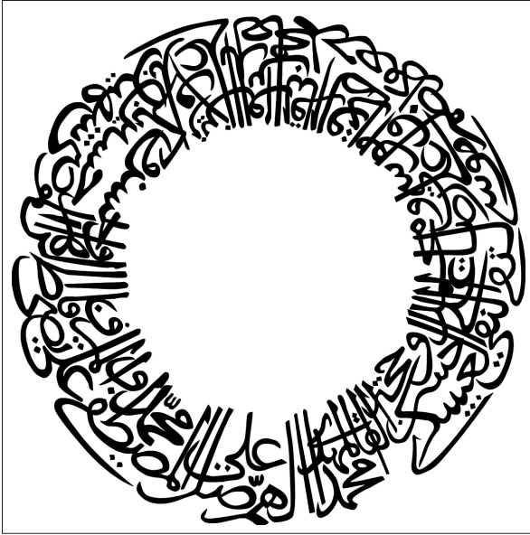
Figure 7. Aḥmad Šāh I Bahmanī mausoleum, interior. Pictorial decoration of the dome, epigraphic band ‘E’

By marking out the names occurring in the decorative ring with the durūd (figs. 6, 7), one reads: