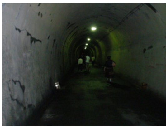
Figure 3. Tourists visiting Kazan tunnel during the tour

ter not to get close to it carelessly. If you absolutely have to walk through it, it is better that you take some o-mamori with you. (Ryūsuidō 2016)