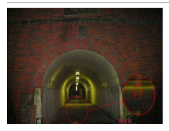
Figure 2. Picture of the ghost of a child in front of the Yamashina side of Kazan Tunnel (Ryūsuidō 2016)