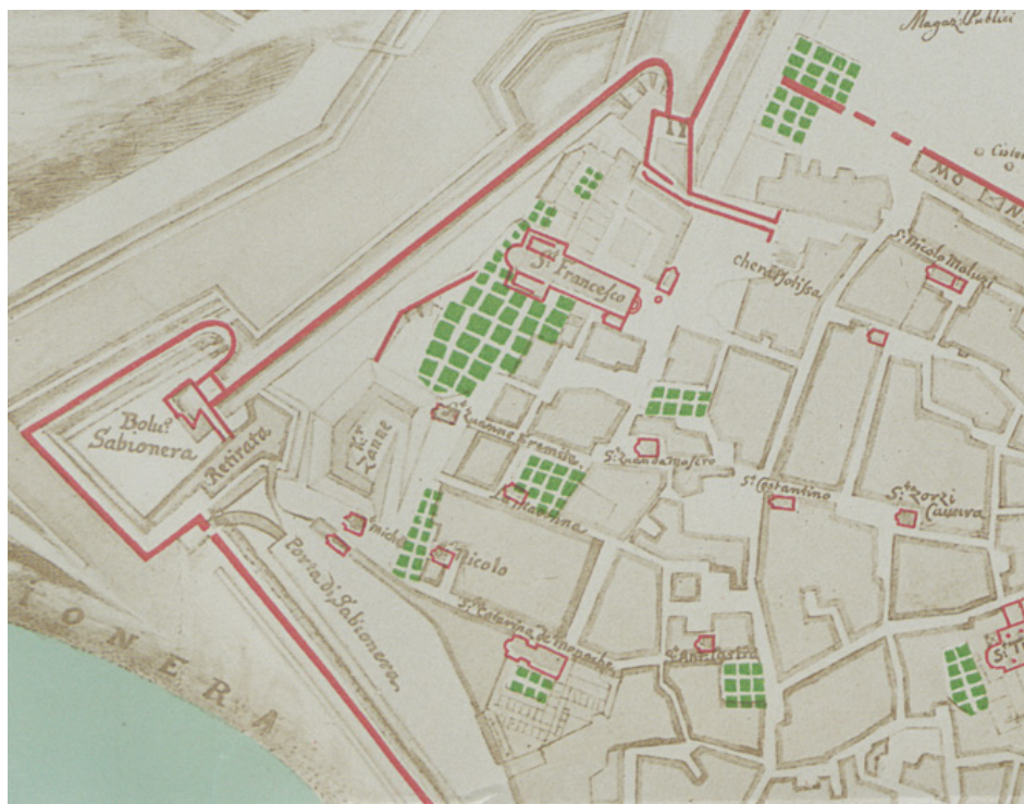
Figure 5: Venetian Candia, Drawing of the town by General Wertmüller