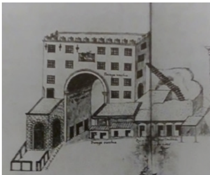
Figure 4. The Voltone Gate of the old fortress Source: Tzompanaki 1996, 63