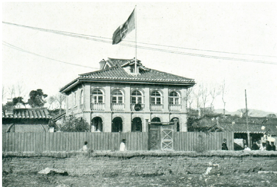
Figure 3. Italian consulate in Seoul, circa 1902.