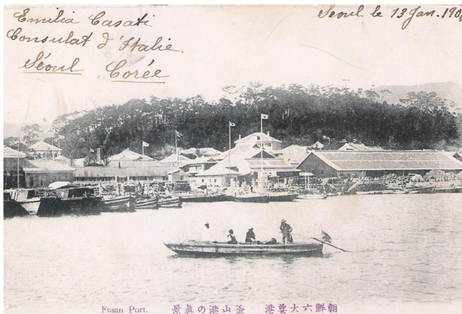
Figure 5. Italian legation, circa 1909.