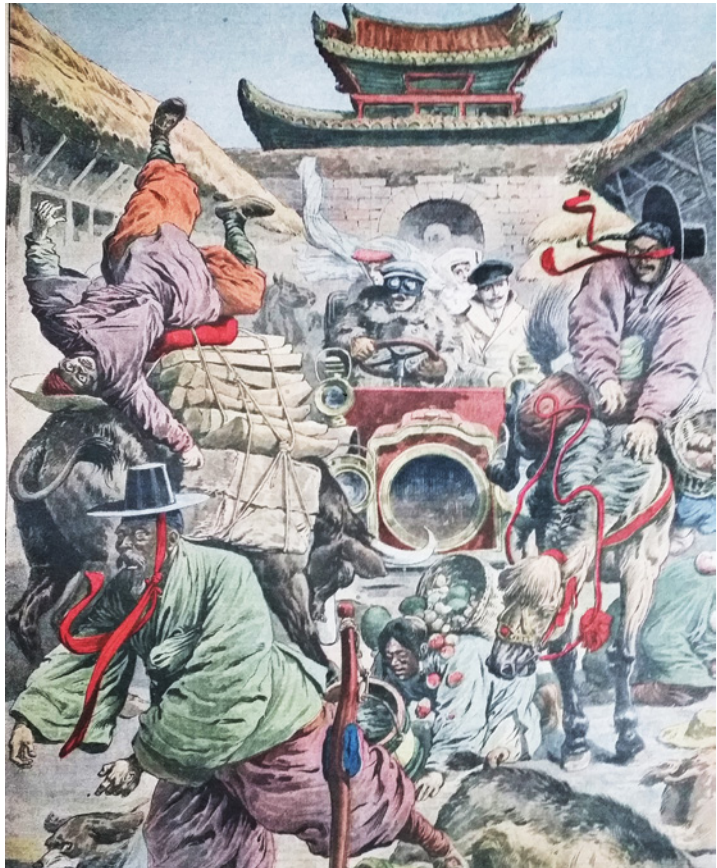
Figure 8 (right). Petit Journal , March 7, 1909