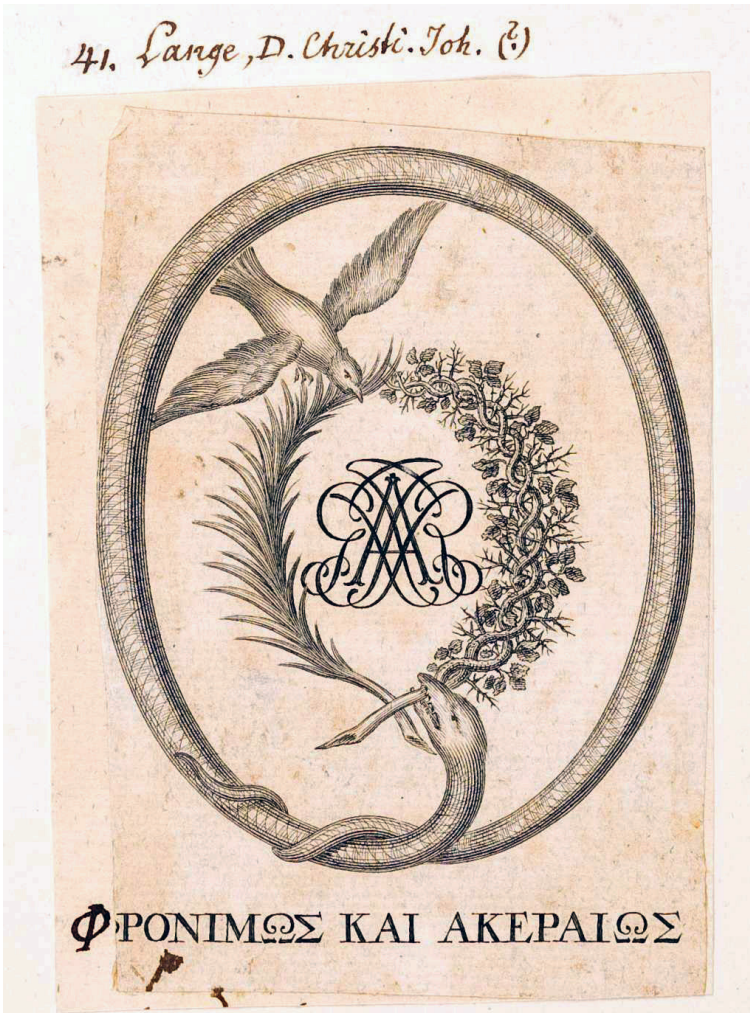
Figure 5 This ex-libris of Christian Johann Lange is not yet described in the CERL PDA, but was found in one of the other collections in Arkyves, in this case the Herzog August Bibliothek Virtual Print Cabinet of Wolfenbüttel