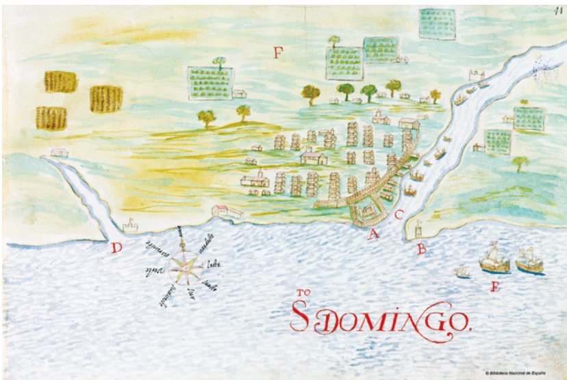
Figure 6.3 The river port of Santo Domingo from a drawing by Nicolás de Cardona from his Descripciones geográficas e hidrográficas de muchas tierras y mares del Norte y Sur en las Indias (1632).

troubles with the same Christians who on that island are with Columbus, I believe through envy, which to avoid being verbose I will not recount. 8