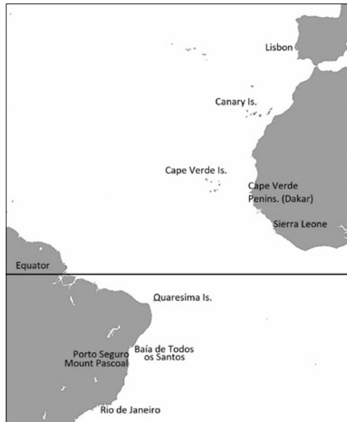
Figure 6.1 The shortest distance across the Atlantic between South America and Guinea

large Indio population. It became increasingly clear to the Indios that the invaders had come to stay and would never leave spontaneously; therefore, they set traps for the disbanded sailors and killed them.