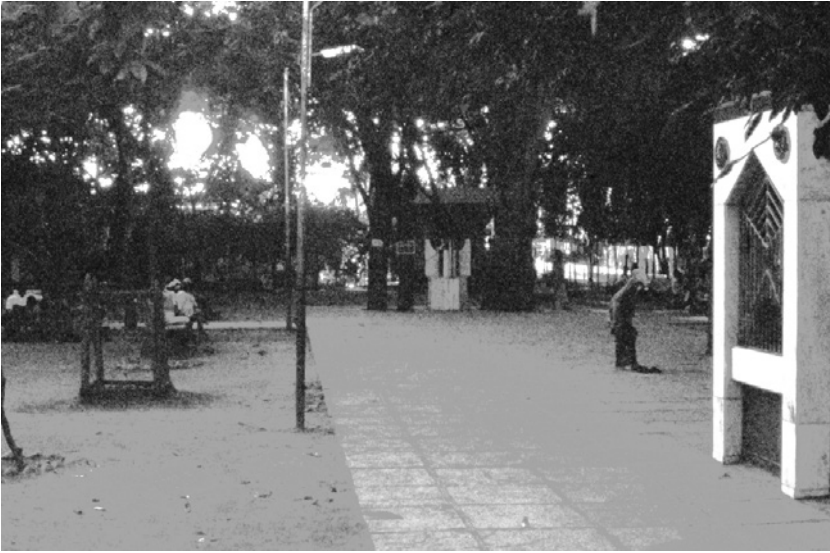
Figure 16 The Leṅḍī gardens at dawn, where Sai Baba used to take walks. In front is the Nanda Deep or ‘Lamp of Bliss’ (between the nim and bodhi trees which were planted by Sai Baba), to the right is the Dattātreya shrine

cried “ Mā bhākrīān ”, which means: ‘Mother, give me some bread’. He then returned to the masjid and always sat near the fire of the dhūnī . 23