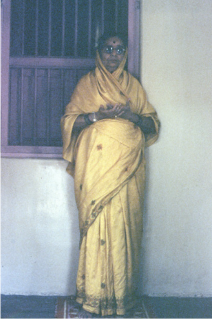
Figure 18 Darshan of Sati Godavari Mata, Sakuri