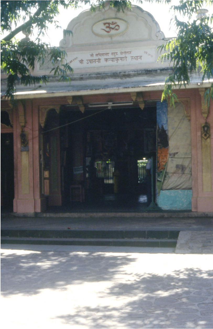
Figure 20 The Śrī Upāsni Kanyākumārī Sthān, Sakuri