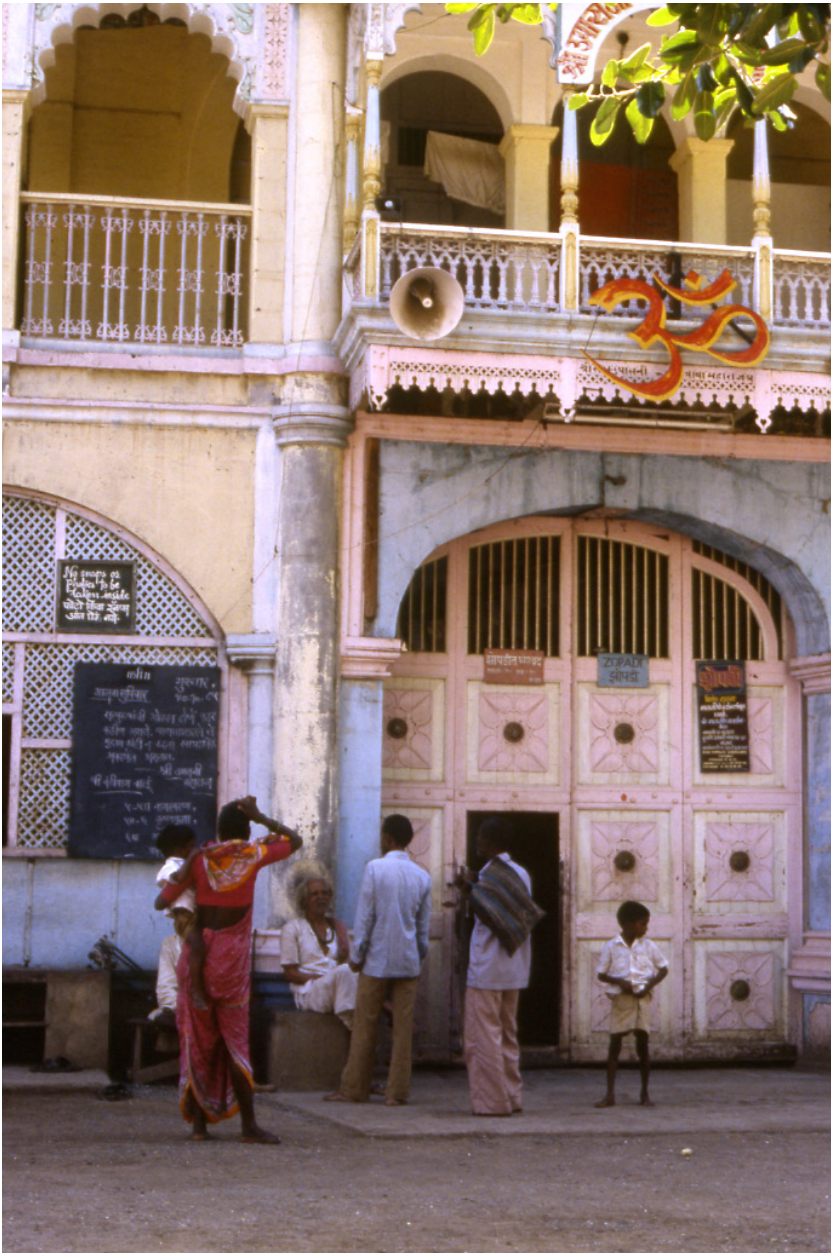
Figure 19 Entrance to the Śrī Upāsni Kanyākumārī Sthān, Sakuri