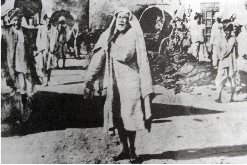
Figure 15 Sai Baba on his begging round in the marketplace of the village

Q Is it true that Baba never gave mantra or upades 20 to anyone?