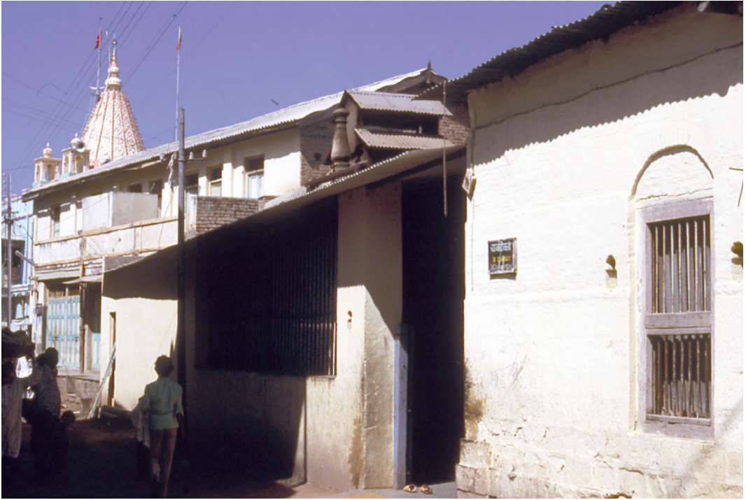
Figure 8 The entrance to the masjid, which Sai Baba at some point renamed Dvārakāmā