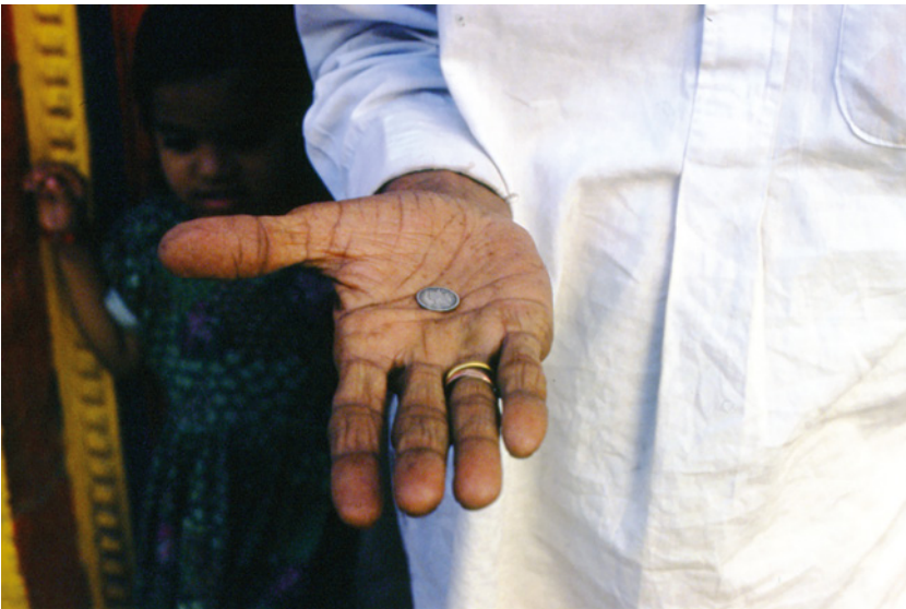
Figure 32 Coin that Sai Baba donated to Bappa Baba and that the latter treasured as a relic