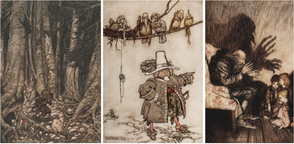
Figure 4 Arthur Rackham. Illustrations from the edition of Rip van Winkle by Washington Irving. 1905. Ink and watercolour drawings reproduced by photomechanical three-colour process