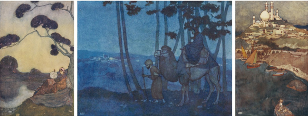
Figure 5 Edmund Dulac. Illustrations from the edition of Stories from the Arabian Nights retold by Laurence Housman. 1907. Ink and watercolour drawings reproduced by photomechanical three-colour process