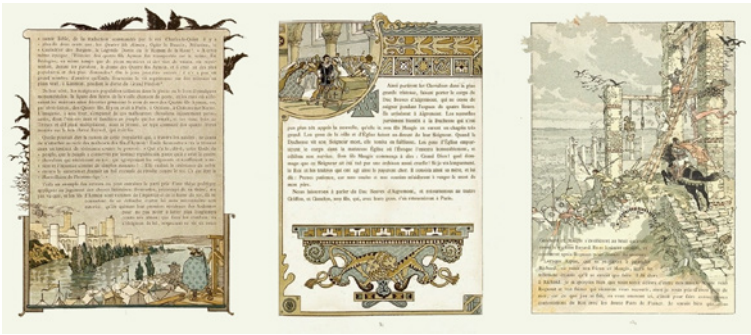
Figure 1 Eugene Grasset. Illustrations from the edition of The four Sons of Aymon ( Les Quatre Fils Aymon ). 1883. Colour lithographs made with the help of the gillotage process

belong to the Arts and Crafts movement). These were small brightly decorated books, often containing a short fairy tale, where the text played a secondary role in relation to patterns and drawings. An example of such English children's book is the 1875 edition of Beauty and the Beast , illustrated by W. Crane in the best traditions of the Arts and Crafts movement.