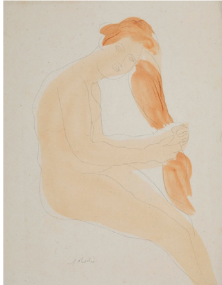
Figure 3 Auguste Rodin. Untitled drawing used in the edition of The Torture Garden (Le Jardin des supplices) by Octave Mirbeau. 1902. Colour lithography

scapes – and nearly the same features are related to the most famous English graphic artist of the 1890s, A. Beardsley. At the same time, Denis's elegant compositions in soft colours with their contour and almost no small details (which was no longer similar to Beardsley) resemble the canvases of the Symbolist Pierre Puvis de Chavannes, who also significantly influenced the famous English graphic artist and publisher of the turn of the century Charles Ricketts. Thus, despite the apparent difference between the English and French illustrative traditions, this indicates the presence of separate parallels in them, which, however, led to different results. Urien's Voyage is a publication that should be considered a successful product of collaboration between the writer and the artist. Denis's drawings for this book and The Imitation of Christ probably influenced the style of some of the graphic cycles of Edmund Dulac, who became one of the most famous British illustrators in the 1900s after moving to London from Toulouse. In the last of these editions, Denis used his knowledge of Italian frescoes (he visited Tuscany and Umbria in 1903) and, in particular, the works of Giotto and Fra' Angelico, whose compositions he used while working on 35 of his illustrations for Dante's book.