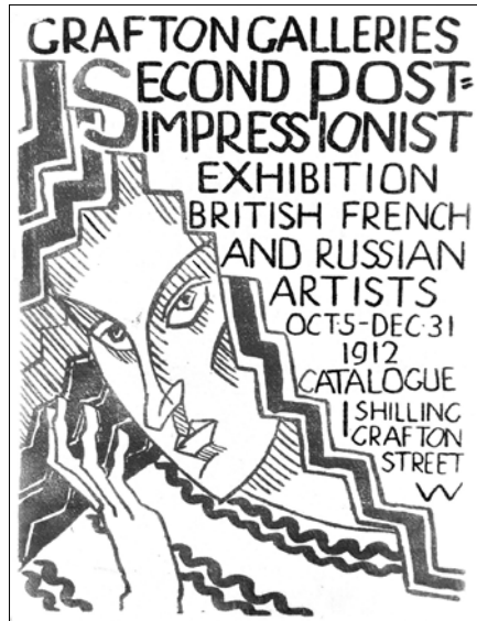
Figure 3 Cover for the catalogue of the Second Post-Impressionist Exhibition , 1912.

to art criticism a solid analytic base, was inextricably combined with his idealism concerning the act of aesthetic contemplation (Twitchell 1987, 42). The same rigour was applied in the way he structured the timeline he drew throughout his two exhibitions. In preparation for the Second Post-Impressionist Exhibition, Fry was much more eager to insist on the linearity of contemporary art development than he was in the previous show. He sought to place one master after another and to structure his narrative as a vital evolution of expressive means.