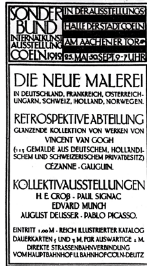
Figure 1 Announcement of the International Art Exhibition of the West German Sonderbund . 1912 (Selz 1957, 242)

the Sonderbund exhibition in 1910. General conservative opinion assumed that there was a conspiracy of Parisian and Berlin art dealers in favour of French art, who had been stringing Germans along and imposing on them overpriced art by foreigners instead of supporting the local schools. Other alleged plotters were progressive museum professionals and critics, who together with the artists blindly following the French were betraying the national traditions (Selz 1957, 238).