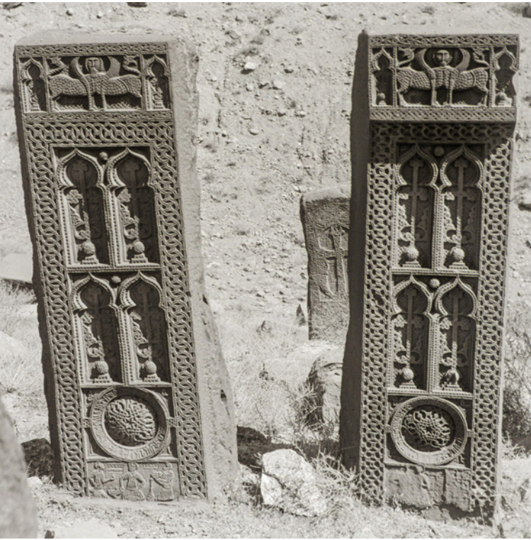
Figure 7 Khachkars. 1588. Julfa. Aram Vruyr's archive, Service for the protection of historical environment and cultural museum-reservations, https://escs.am/am , Ministry of Education, Science, Culture and Sport of RA, digitized by Julfa cemetery repatriation digital project. Photo by Aram Vruyr, 1915

At the same time, Julfa khachkars are not creations in isolation. The distinct composition division into cornice, niche, rosette (and sometimes scenes with human beings), for example, is a standard feature for khachkars from the fifteenth and seventeenth centuries with one exception: Julfa khachkars make a vibrant architectural statement. The same can be said about a number of decorations: the use of small crosses and stars as well as the absorbing of rosette in the slab are commonplace. But in Julfa's case, their use is more expressive, symmetric, and perfect. There are unique Julfa decorations as well, such as acanthus blossoms enclosed in trefoil arches that along with oval blossoms border the edges and sometimes the cornice; and of course, the lancet shape arches show absolutely new architectonic feature [figs. 5-7], borrowing from Muslim or even European architecture.