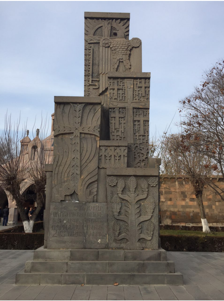
Figure 13 Khachkar on memory of Genocide. 1965. Author Raphael Israelyan, Holly See Echmiadzin. © Author, 2019