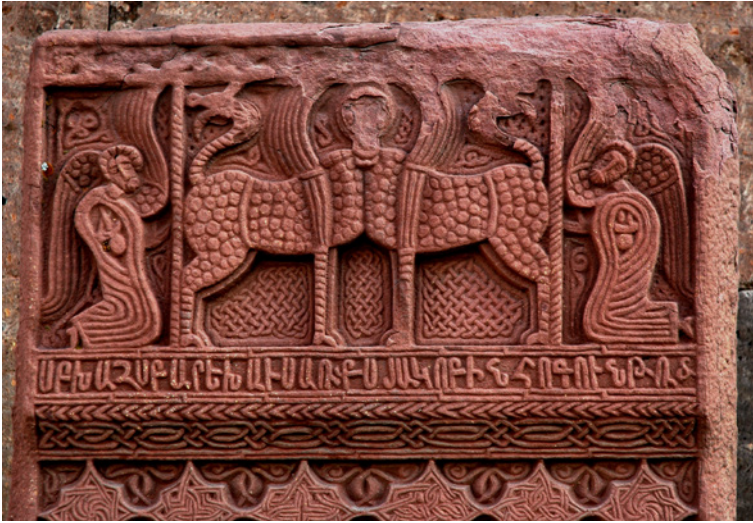
Figure 9 The Sphinx , khachkar's cornice. 1601. Julfa, now in Holly See Echmiadzin.