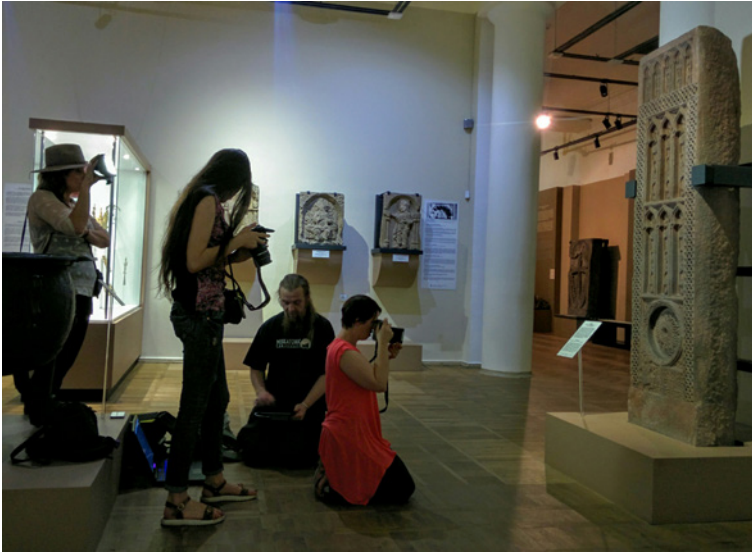
Figure 20 The Julfa cemetery repatriation digital project team at the digitizing work in the State museum of history of Armenia, 29 May 2016.

We have fought very hard to restore Julfa cemetery in light, with a view to making Azerbaijan accountable for their act of vandalism in 2006, which robbed all Armenians of their cultural heritage. We have accumulated a vast archive of photographic evidence and have presented exhibitions of the cemetery, as a 15 m 3D visualisation, in Rome. We have risked our lives to get precious photographs of the Julfa site in Azerbaijan and have travelled across the Caucasus to gather almost every existing photograph of Julfa cemetery. We have photographed every surviving stone. Our goal of creating a huge 3D reconstruction of the cemetery and using it as proof of cultural genocide against Armenians to the world is not achievable without support. I want to thank everyone who has contributed to this project, especially our Armenian supporters. I would like to ask our friends in the Armenian apostolic church to pray for a miracle. 4