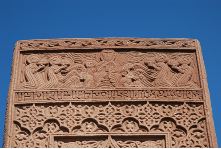
Figure 8 The Last Judgement , khachkar's cornice. 1602. Julfa, now in Holly See Echmiadzin.