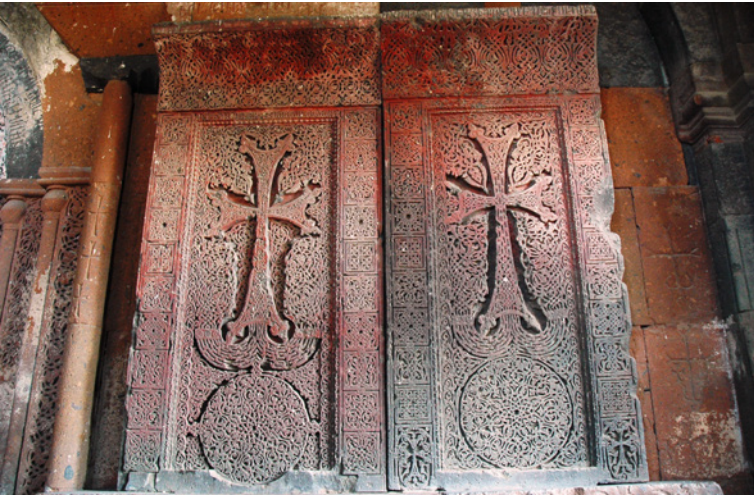
Figure 1 Medieval cemetery with khachkaras, 12-17th cc, Arinj, Kotayk province.