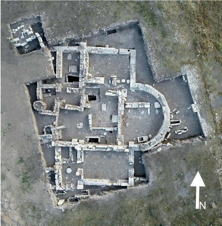
Figure 2 Aerial photograph of Church B trench in the Upper City of Amorium