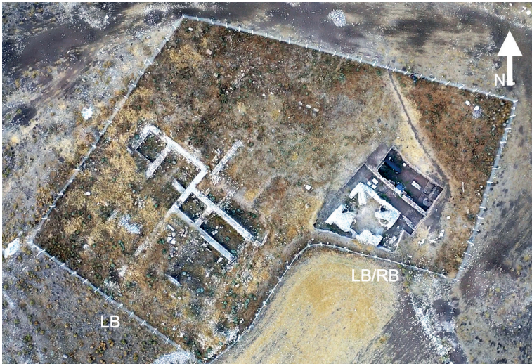
Figure 4 Aerial photograph of the Large Building complex, old (LB) and new (LB/RB) trenches, in the southwestern Lower City of Amorium