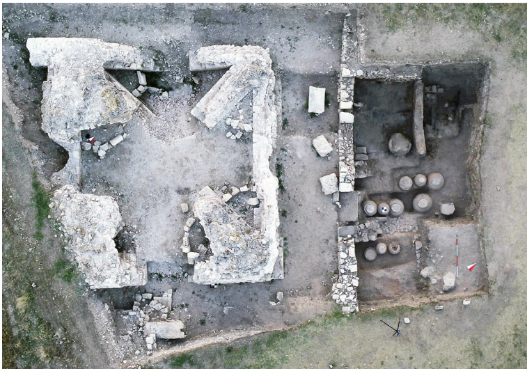
Figure 5 Aerial photograph of the Large Building new south trench (LB/RB) in the Lower City of Amorium