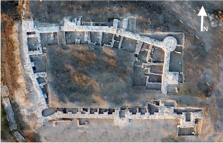
Figure 3 Aerial photograph of the Upper City Citadel trench of Amorium

in the south-west corner of the Upper City. The Inner Wall addition formed a horizontal L shape and abutted the preexisting wall segments and created a roughly rectangular new fortified space with walls as strong as the main city walls. This was not only a space separated from the rest of the Upper City area, but was also very important in terms of being the third and final line of defence for the city.