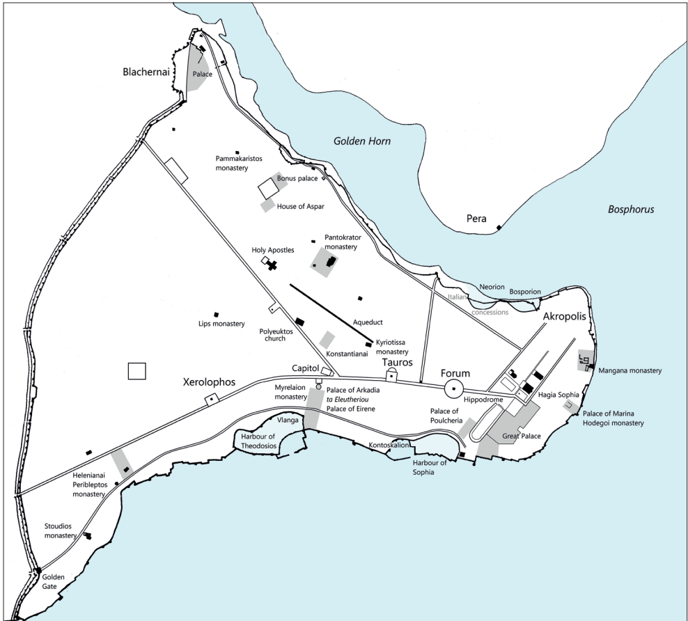
Figure 1 Medieval Constantinople, with principal objects mentioned in the text. Drawing by the Author