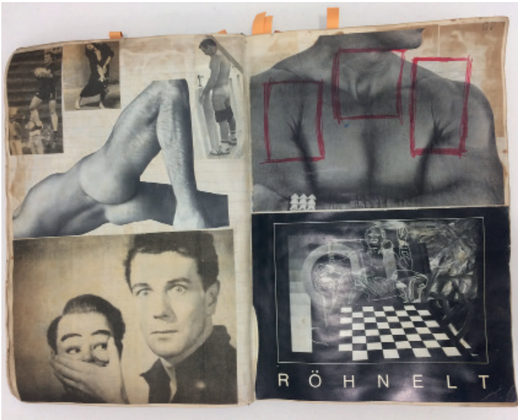
Figure 5 Hudinilson Jr., Caderno de referências XVII . 1980/2000s. Photographic prints, newspaper and magazine cutouts, photocopies and documents on paper. Unique. 23 × 32,5 × 10 cm (closed).

the 1960s and 1980s, ALBUM reflects in retrospect on the popular imagery present in Scandinavian households during that period. It offers a refined and sharp meta-narrative on the human body, sexuality, and social life of images that shows how the media act and create stereotypes and, at the same time, how the reader can transform these streams of information into elements of cultural critique [figs 7-8]. Scrapbooking, habitually used to reframe the present, becomes a propaedeutic tool for a mocking and biting, but no less serious, rereading of cultural history. Indeed, the hilarity that exudes from the pages of the fanzine takes no time to reveal itself for what it actually is: a sincere and superficial questioning of a series of taboos and clichés on which Scandinavian, and more generally, European culture has been culturally and sexually erected. The chosen images are neatly displayed, always in their entirety and never overlapping, and the reading is organised into a series of heavy themes expressed in the form of ironic questions, such as “on heterosexuality, or why does the gay version always look better?” Or “on the condition of the lonely man and his search for meaning and love” [fig. 9].