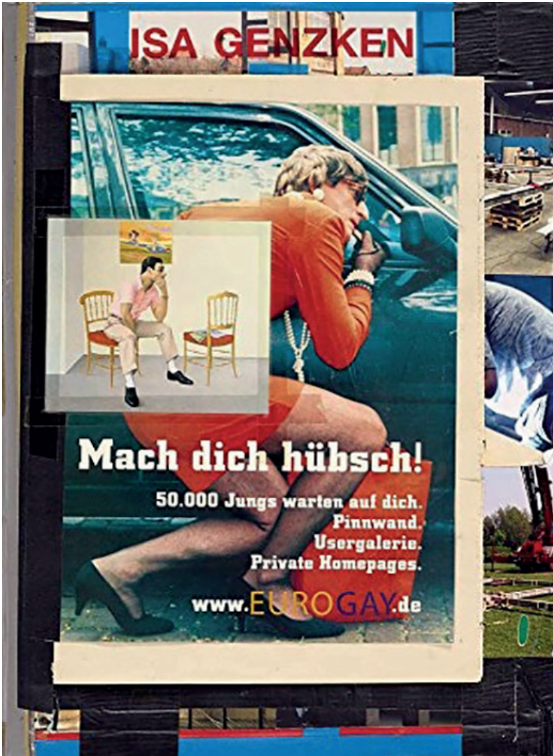
Figure 10 Isa Genzken, Mach dich hübsch! . 2015.