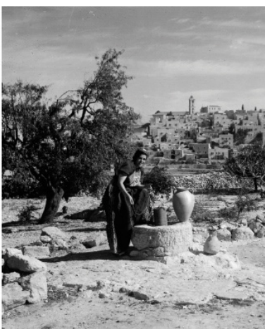
Figure 2 The iconography of women at the well between the sacred and the profane. Left: Cypriot women at the well, as illustrated by Antonio Mondaini (adapted from Namindio 2007, 331). Right: woman figure (Sofie) at the well clad in richly embroidered costume. Bethlehem on the background (photo dated 23 September 1938).