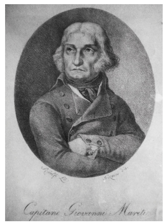
Figure 1 Portrait of Giovanni Mariti. Litografia Ridolfi-Gozzini. Fondo Mariti. Courtesy of Archivio Storico dell'Università di Bologna

chronicles (Viaggi per l'isola di Cipro e per la Soria e Palestina fatti dall'anno 1760 al 1768, Istoria della guerra accesa nella Soria l'anno 1771 by the arms of Aly-Bey of Egypt, Istoria della guerra della Soria proseguita fino alla fine di Aly-Bey of Egypt, Memorie istoriche di Monaco de' Corbizzi fiorentino Patriarca di Gerusalemme, Cronologia de' Re Latini di Gerusalemme, Dissertazione istorico-critica sull'antica città di Citium, Istoria di Faccardino Grand-Emir dei Drusi, Memorie istoriche del Popolo degli Assassini e del Vecchio della Montagna loro capo e signore), and the scientific essays (Del Vino di Cipro, Della Robbia).