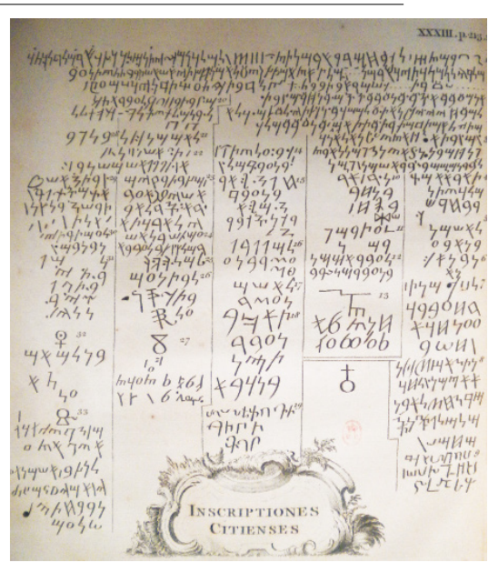
Figure 6 Inscriptions from ancient Kition. Citienses Inscriptiones (adapted from Pococke 1743, Pl. XXXIII)

that had developed in Larnaca, indicating their names: 'La Scala', the 'Castro' and 'old Larnaca'. In the schematic drawing of the city he illustrates, the toponym 'Bamboula', site of ancient Kition is also indicated, without, however, mentioning any evident, emerging, or visible archaeological remains (Severis 1999, 9-19; Yon 2011, 34).