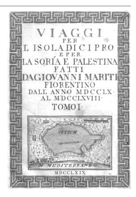
Figure 3 Frontispiece of the Viaggi , Tomo I, with the sketch map of ancient Kition (from Mariti 1769)

tectural reworking of monumental Gothic complexes dating back to the time of the French Lusignan rule. An architectural phenomenon that is also historically important, to which Mariti is a close witness. In precise detail, he describes the church and sacred area of St Sophia in Nicosia and in Famagusta the church of St Nicholas, built in the early fourteenth century at the behest of the Genoese governor of the city and transformed into a mosque in 1571 with the construction of the minaret in place of one of the side towers on the façade.