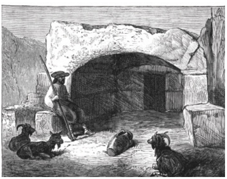
Figure 7 Chamber tomb described and located by Mariti in the Phaneromeni vicinity. as later appeared to Luigi Palma di Cesnola (1877, 49) (top) and in The Illustrated London News (Suppl. Illustrated London News, 5 October 1878, 325) (bottom)

They have discovered a great number of ancient sepulchers in and about the city of Larnaca: I saw some built of hewn stone: in one of them I observed the stones were laid long the top like large beams, and others laid over them like a floor: there is another which ends at top in an angle, and both are of excellent workmanship and finished in the most perfect manner. (Pococke 1743, 213)