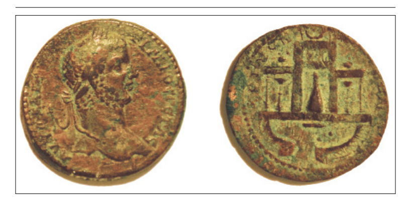
Figure 9 Roman bronze coin of the Emperor Geta (MAEC inv. 99801).

revealed that the Cortona numismatic collection includes at least one survivor of Mariti's Cypriot donation.