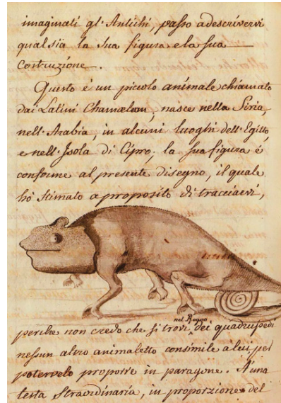
Figure 13 The Cypriot chameleon illustrated by Antonio Mondaini (adapted from Namindiu 2007, 304)

addressed to Mariti and preserved in Bologna. It is a letter sent from La Manon in Provence and dated 10 May 1788 in which we read: