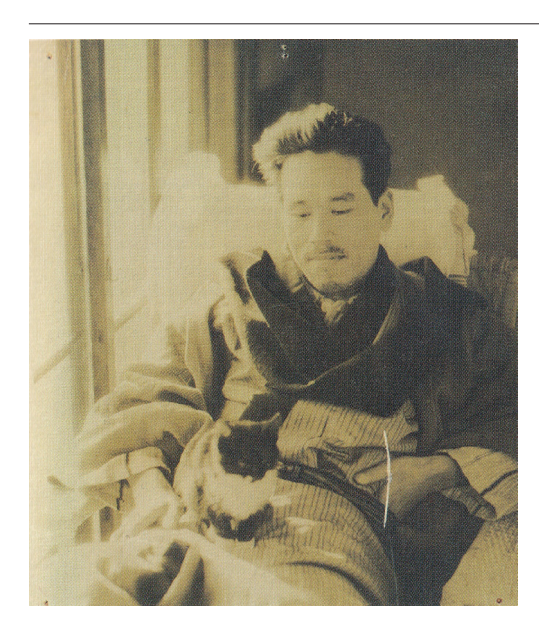
Figure 3 A photograph of Itami Mansaku, taken during his final illness by a childhood friend and fellow scriptwriter, Itō Daisuke. Sourced from Itami Jūzō Kinenkan Gaidobukku (2007)

I am one of those who believes that in the form of the scenario lies a unique appeal [omoshiromi] that cannot be found in any other type of literature. [...] While being primitive in form, its implied meanings [ganchiku] and suggestive power [shisaryoku] surpass any literary craftsmanship. (Itami 1937, 21-2)