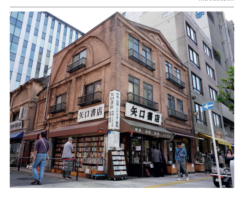
Figure 1 Yaguchi Shoten, located in Tokyo's Jinbōchō used bookstore district, was founded in 1918 and specialises in film and theatre-related publications. Note the word 'scenario' on the signboard.

Aside from the particulars of his itinerary, Satō appears to be describing a practice that was common among the members of his postwar generation with profound interest in cinema. At the time, the Japanese film industry was on a quick track to recovery after years of ideological pressure and material shortages. However, insufficient film preservation practices, together with firebomb campaigns at the end of the war that reduced the country's major cities into a wasteland, had all but ensured that the majority of actual film reels, made from highly inflammable nitrate stock, were forever lost. Satō (1975, 289) admits that reading the scenarios of celebrated prewar films no longer available for watching, usually resulted in convincing him of their historical significance, which he had hitherto possessed no means to validate. The above personal recollection attests to the crucial role that published film scripts played for the largely self-educated cinephiles as a way to experience and reconnect with a body of cinematic tradition that had disappeared in its visual guise but could - with the aid of some imagination - still be retrieved in a textual form from the pages of film journals, script anthologies, and volumes dedicated to the work of individual scriptwriters.