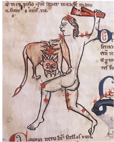
Figure 9. Constellation of Hercules. Venezia, BNM, ms. Lat. VIII 22 (= 2760), fol. 31v. Northern France or England, last quarter of the 12th century (with permission of the MiBACT)