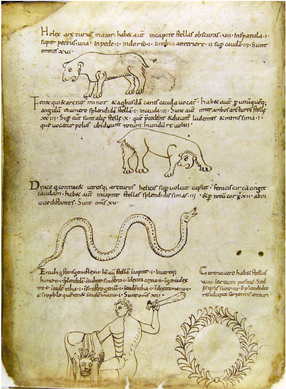
Figure 4. Opening folio of the star catalogue De signis caeli . Padova, Pontificia Biblioteca Antoniana, ms. 27, fol. 130v. Verona, early 10th century (with permission of the Pontificia Biblioteca Antoniana)