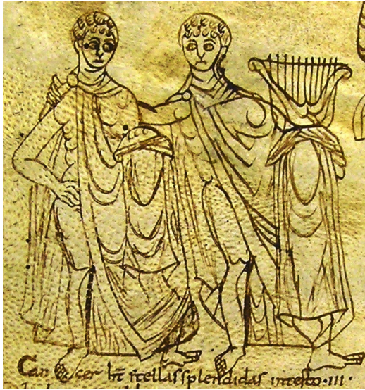
Figure 13. Constellation of Gemini . Padova, Pontificia Biblioteca Antoniana, ms. 27, fol. 131v. Verona, early 10th century