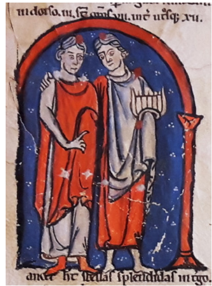
Figure 14. Constellation of Gemini . Venezia, BNM, ms. Lat. VIII 22 (2760), fol. 32v. Northern France or England, last quarter of the 12th century (with permission of the MiBACT)

lowed on the next page by the traditional Aratean illustration featuring Draco and the Bears together, with the Bears drawn in two different colours in order to distinguish them from one another (fol. 160v). Compared with this situation, the second recension of the De signis caeli simply eliminates the repetition of the identical images, by removing the two Bears from the third illustration and thus leaving Draco alone. The same simplification is also found in a second Carolingian star catalogue, the slightly later De ordine ac positione stellarum in signis , derived from the Latin commentary (the so-called Scholia Basileensia ) which accompanies Germanicus' translation in the manuscripts of the O family. This text was exceptionally widespread in the Carolingian period, thanks to its inclusion in the so-called Libri computi , the large computistical encyclopaedia prepared under the auspices of Charles the Great, probably under the direction of Adalhard of Corbie, and published in Aachen in AD 809. 22 Here, too, Draco has been separated from the Bears and appears as an isolated