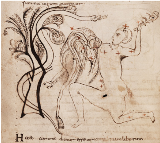
Figure 8. Constellation of Hercules. Basel, Universitätsbibliothek, ms. AN IV 18, fol. 14v. Fulda, ca. AD 820-830