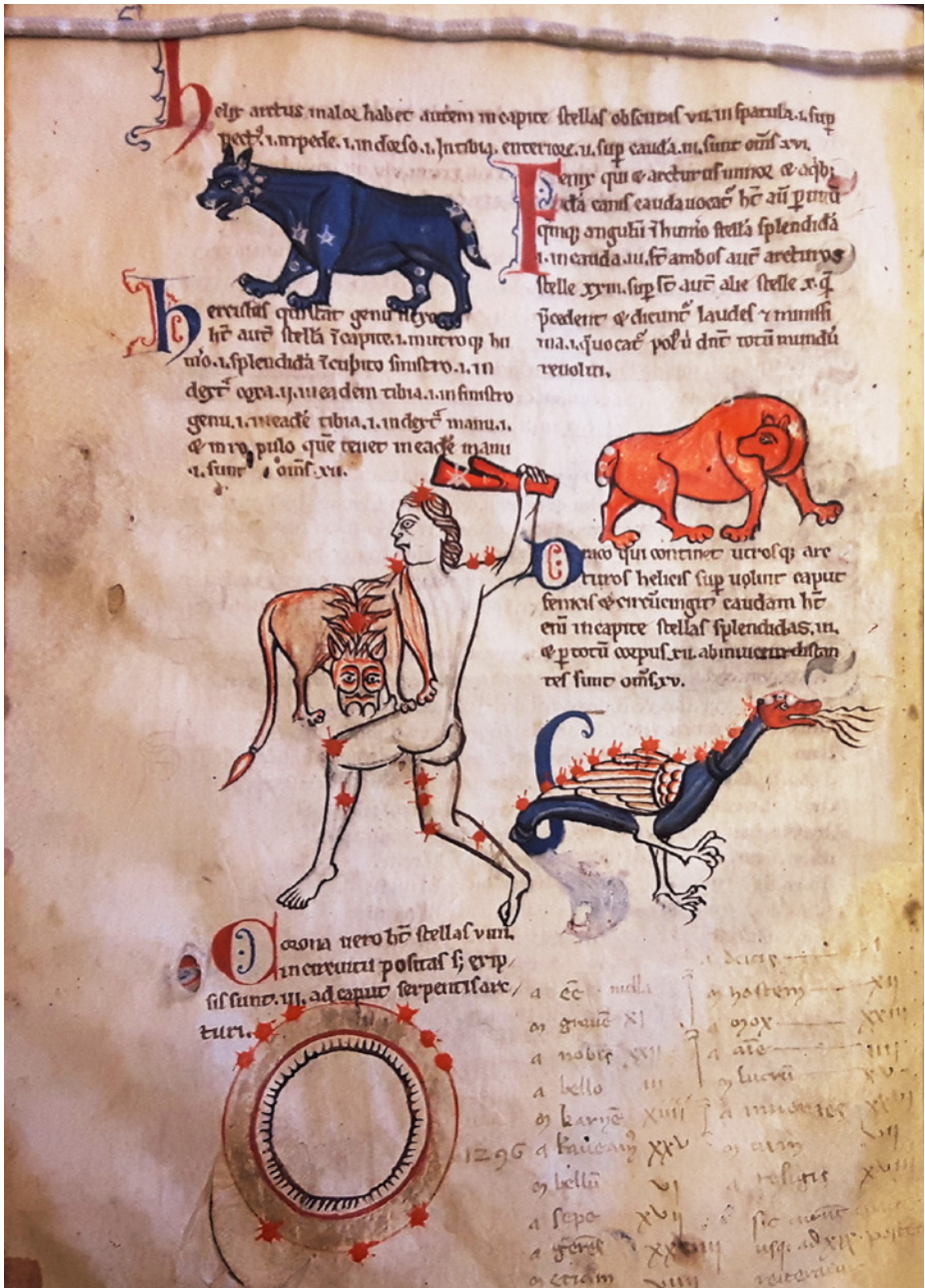
Figure 3. Opening folio of the star catalogue De signis caeli . Venezia, BNM, ms. Lat. VIII 22 (2760), fol. 31v. Northern France or England, last quarter of the 12th century