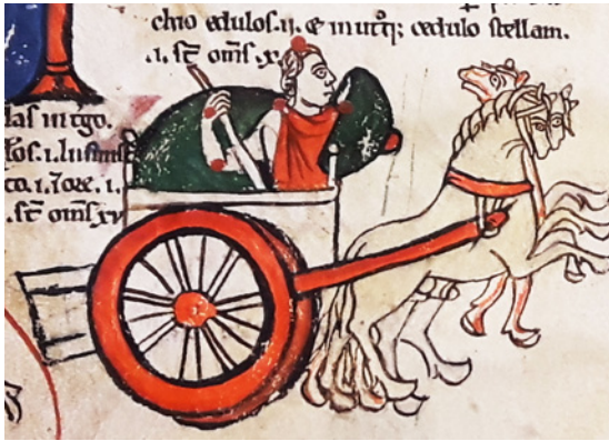
Figure 17. Constellation of Auriga . Venezia, BNM, ms. Lat. VIII 22 (2760), fol. 32v. Northern France or England, last quarter of the 12th century