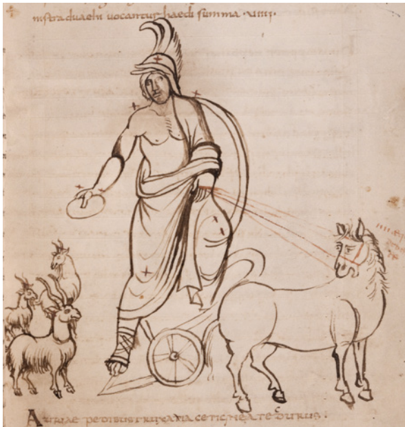
Figure 16. Constellation of Auriga . Basel, Universitätsbibliothek, ms. AN IV 18, fol. 22r. Fulda, ca. AD 820-830