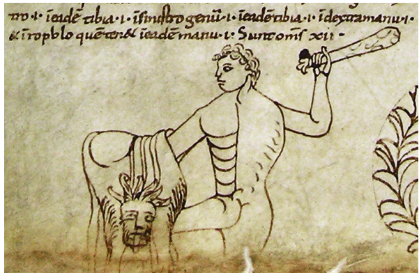
Figure 10. Constellation of Hercules. Padova, Pontificia Biblioteca Antoniana, ms. 27, fol. 130v. Verona, early 10th century