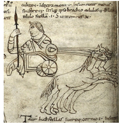
Figure 18. Constellation of Auriga . Padova, Pontificia Biblioteca Antoniana, ms. 27, fol. 131v. Verona, early 10th century

illustration found in the manuscripts now in Venice (fig. 9) and Padua (fig. 10) clearly derives from the same tradition: the hero is represented in an identical posture, seen from the back (that is, in globe view), kneeling on his right knee, with the club in his right hand and the lion skin on his left arm. But in these two manuscripts, as in all those of the second recension of the De signis caeli , the Dragon and the apple tree have been removed; the same simplification is found, again, in the earliest manuscripts of the other Carolingian star catalogue, the De ordine ac positione stellarum in signis (Madrid, Biblioteca Nacional de España, ms. 3307, fol. 55r).