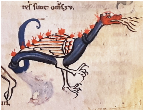
Figure 5. Constellation of Draco . Venezia, BNM, ms. Lat. VIII 22 (2760), fol. 31v. Northern France or England, last quarter of the 12th century