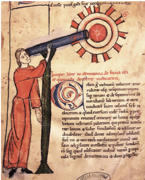
Figure 1. A monk measures the hours of the night using Pacificus' horologium nocturnum . Venezia, BNM, ms. Lat. VIII 22 (2760), fol. 1r. Northern France or England, last quarter of the 12th century

him an exceptional activity in the restoration of religious buildings, the organization and direction of the cathedral scriptorium , and the pursuing of various artistic and scientific enterprises. Pacificus' personality has been re-evaluated in recent years (Marchi 2002, Stella 2014), as a reaction to the thought-provoking book by La Rocca 1995 (whose conclusions are restated in La Rocca 1996 and 2000), which had cast doubt on the reliability of the information found in the funerary inscription. According to La Rocca, Pacificus as a patron and scientist was a 12th century fabrication of Veronese collective memory, which transformed a quite obscure Carolingian priest into a cultural leading figure, with the aim of highlighting the importance of the city's past and of legitimising the authority of the bishop in relation to the cathedral chapter and the lay civic institutions. But, as Francesco Stella recently pointed out, "la sua [i.e. La Rocca's] ricostruzione, basata quasi soltanto su documentazione archivistica, omette proprio le attestazioni poetiche dell'attività di Pacifico, che sono invece databili senza dubbio al IX e non al XII sec." (2014, 189), as witnessed by a number of astronomical and computistical manuscripts. "È possibile e, direi, quasi fisiologico che la sua figura sia stata mitizzata o almeno en-