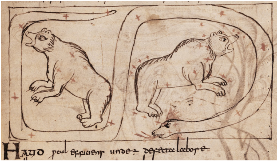
Figure 7. The circumpolar constellations . Basel, Universitätsbibliothek, ms. AN IV 18, fol. 14r. Fulda, ca. AD 820-830

do not appear to be immediately derived from one another, points to the fact that, at the origin of this tradition, too, there may easily have been a one-column model: such a conclusion confirms that, despite the evocative similarity of the two-column format to the so-called ‘ rotulus-style ’, the ancient model which gave origin to the whole textual and visual tradition of the De signis caeli was actually a one-column late Roman codex with lavish full-page illustrations, and the change in favour of a two-column layout was a Carolingian innovation, to be ascribed mainly to economic reasons.