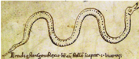
Figure 6. Constellation of Draco . Padova, Pontificia Biblioteca Antoniana, ms. 27, fol. 130v. Verona, early 10th century

manuscripts share a characteristic detail in their layout, which does not appear in any other witness of the same group. In the Venice manuscript, the first entry of the De signis caeli , presenting the constellation of Ursa Maior, is initially written on one column, taking up only two lines of text; then, the scribe decided to shift to a two-column layout, in order to save space: thus, the image of Ursa Maior was drawn in the left half of the page, leaving space in the right column for the text of the second constellation entry, Ursa Minor. This decision, however, caused a problem, for as a consequence the scribe continued to use the right column for the entries about Ursa Minor and Draco, then placing the fourth and fifth constellations, Hercules and Corona Borealis, in the left column which he had previously left blank. As a result, the reader is now faced with the wrong sequence: Ursa Maior - Hercules - Corona Borealis - Ursa Minor - Draco (fig. 3). Significantly, this problem in the layout of the first page is also found in the Padua manuscript (fig. 4): here, too, the scribe started out by copying the text in one broad column, and only after the third constellation he realised that he could save space by shifting to a two-column layout. This change of mind regarding the layout, occurring in two manuscripts which