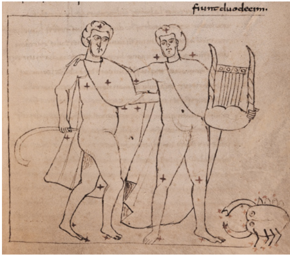
Figure 15. Constellation of Gemini . Basel, Universitätsbibliothek, ms. AN IV 18, fol. 20r. Fulda, ca. AD 820-830