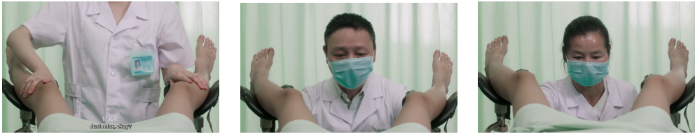
Figure 2 Vivian Qu, Angels Wear White . 2017. 92'57". The Nurse