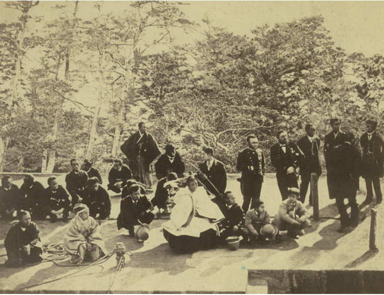
Figure 1 Baron Raimund von Stillfried, His Imperial Majesty the Tenno of Japan and Suite . 1 January 1872. https://upload.wikimedia.org/wikipedia/commons/6/63/Emperor_Meiji_Inaugurating_Yokosuka_Arsenal_Jan_1_1872.png

and their negatives were confiscated. The incident, however, had far-reaching implications for the government's policy of representing the emperor. As Luke Gartlan (2016, 73-100) has shown, there is a direct causal link between the illegal photograph and the subsequent total control that was enforced over the possession, display, and distribution of photographs of the emperor, as well as the official commissioning of imperial portraits by Japanese photographer Uchida Kuichi 内田九一 (1844-75).