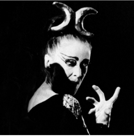
Martha Graham.