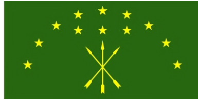
Figures 1-2 The contemporary Circassian flag in Jordan (left) and the detail of the twelve tribes (above)