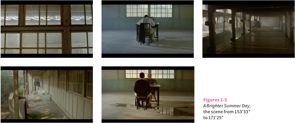
Figures 1-5 A Brighter Summer Day , the scene from 153'33" to 171'25"

Japanese colonial rule with a contemporary regard, conveying another historical interpretation. Hence, we can observe that the focus of NHF has shifted from grand narratives to small narratives, with a tendency to deconstruct mainstream and authoritarian narratives, 22 embodying a collage style of post-modern narrative.