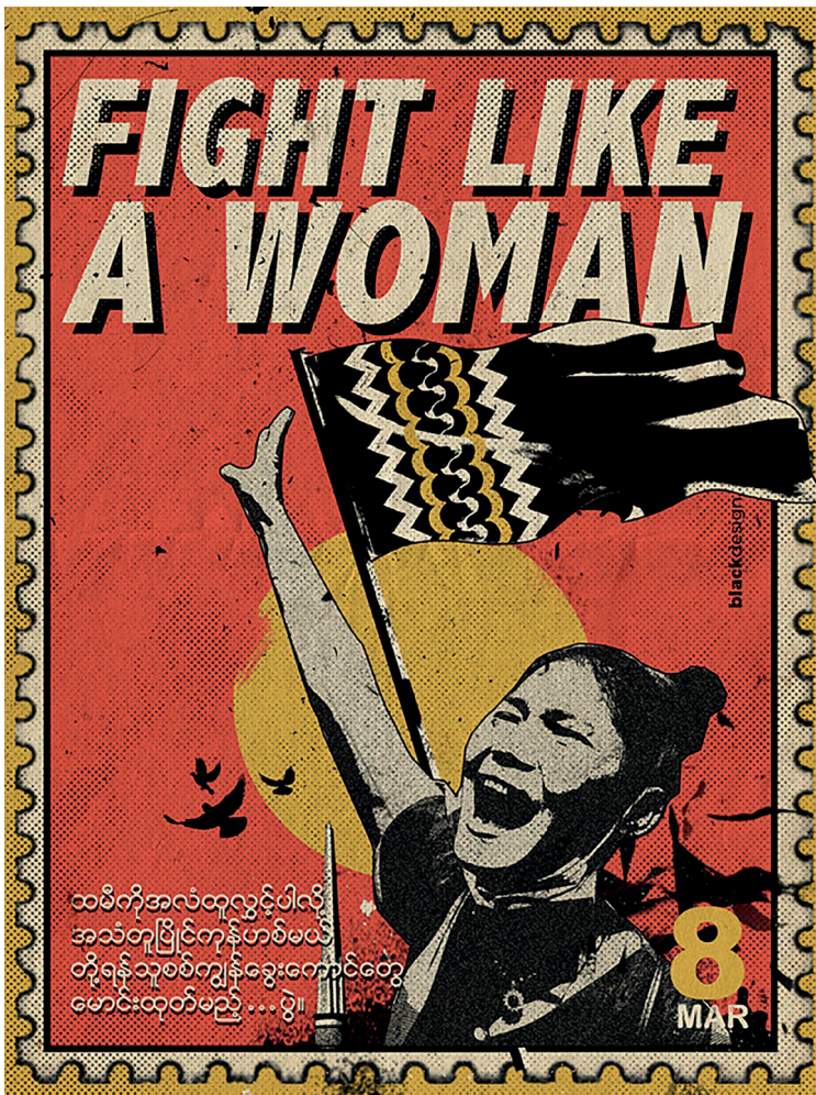
Figure 3 BlackDesign. 2021. Digital protest art. Reproduced with kind permission and courtesy of the artist

With this in mind, I want to draw our attention to Figure 3, which connects the Three Finger Salute , with another recurrent symbol of the Spring Revolution, the htamain , which emerged from the very particularities of vernacular experiences.