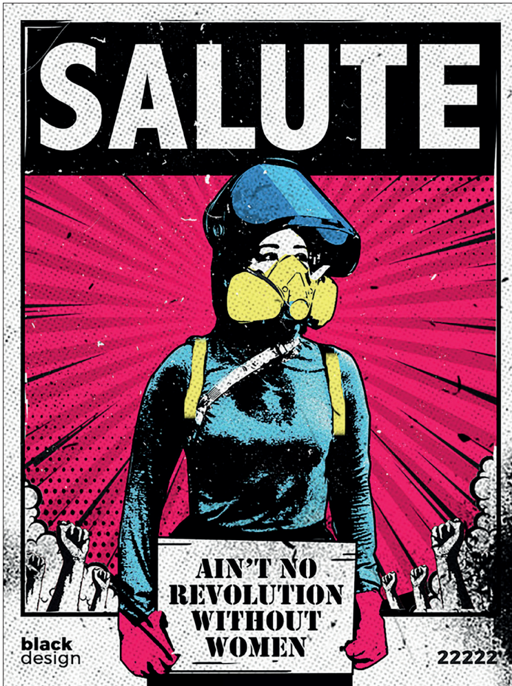
Figure 2 BlackDesign. 2021. Digital protest art. Reproduced with kind permission and courtesy of the artist

struggles to be read from this depiction (whether intended when creating or not). I argue that a thinking-with such artworks helps when thinking through historically embedded, structurally moulded relationalities among people(s) that have become unveiled within the 2021 Spring Revolution.