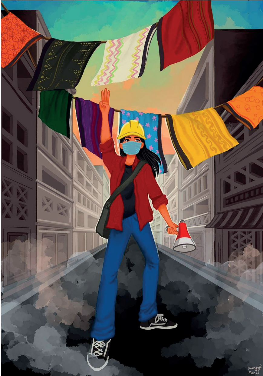
Figure 1 Aung Ye, 2021. Digital protest art.