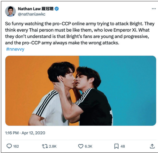
Figure 1 Law, N. So Funny Watching the Pro-CCP Online Army Trying to Attack Bright. 2020. https://x.com/nathanlawkc/status/1249219916323942400