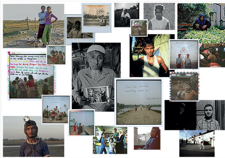
Figure 2 Rohingya Community Ireland (text) & J Francis Cerretani (images), Collage showing the Bridging connections of Transnational Rohingya networks . 2019. Photographic collage. Myanmar, Bangladesh, Malaysia, Ireland. Copyright J Francis Cerretani 2019

village on the perimeter of Sittwe, Rakhine State or as Rafique refers to by the pre-colonial names Akyab, Arakan. 10