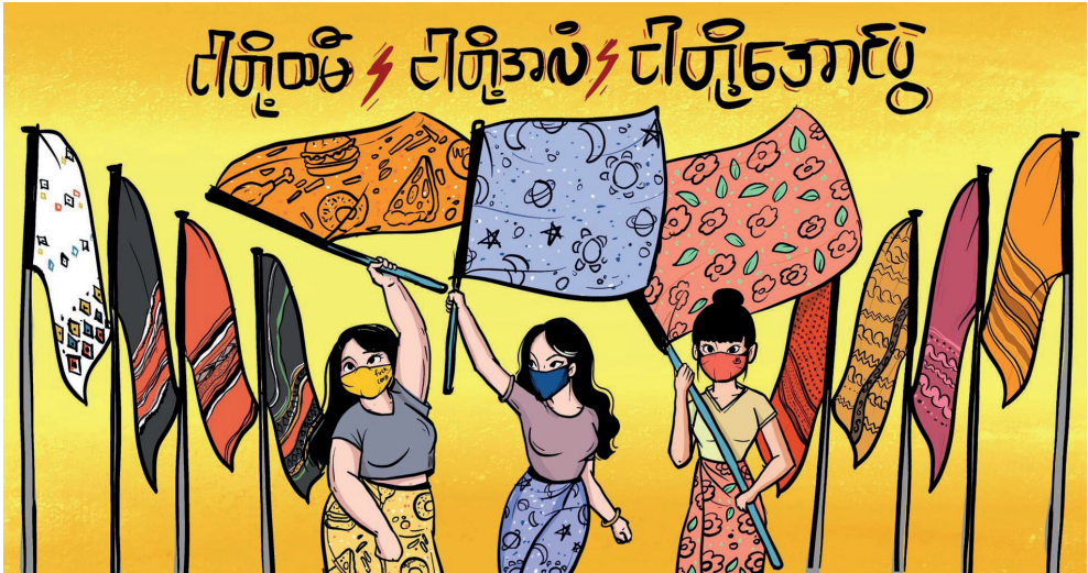
Figure 4 kueecool “Our Longyi ⚡ Our Flag ⚡ Our Victory 🇲🇲”. 2021. Digital protest art. Source: https://www.instagram.com/p/CMHharAFT-2bfYvX5lFgi_KNFKehDVS9XNkumw0/ . Reproduced with kind permission and courtesy of the artist

Within this superiority of men over women, this particular (if hegemonic) interpretation of ဘုန်း ( hpone ) includes the assumption that a man’s hpone may be diminished by women in multiple ways, with real material consequences for everyday life. As such, it defines women’s place in society as based in a spatial hierarchy where a woman is not to inhabit (physically and thus metaphorically) higher places than men when sleeping or sitting, and regulates participation in specific religious practices, like the in/ability to touch Buddha statues or enter certain areas in pagodas. 12 Moreover, the gendered storing and washing of clothes has been engrained in the (crumbling?) majority of society. 13