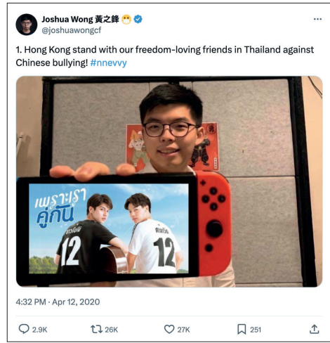
Figure 2 Wong, J. I. Hong Kong stand with our freedom-loving friends in Thailand against Chinese bullying! #nnevy. 2020. https://x.com/joshuawongcf/status/1249254158538072064