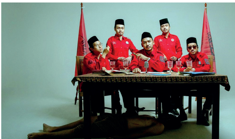
Figure 2 Feast, band photo depicting symbols of nationalism, 2022. @ffeast. Instagram. Jakarta, 2022. Copyrights Feast