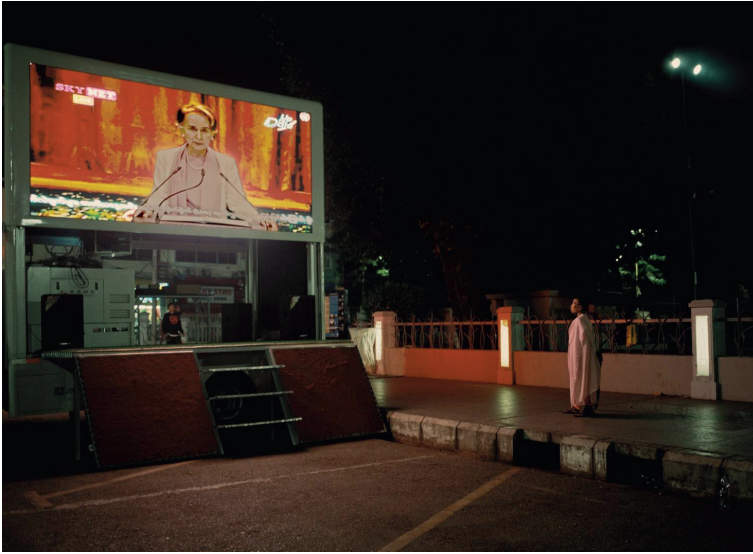
Figure 1 A Burmese nun watches a large screen projecting the International Court of Justice's initial hearings in the case of Genocide against Rohingya. 2019. Photograph. Yangon, Myanmar.

all who struggle for liberation” (10). At the core of many issues of disharmony in Burma are essentialised forms of ethnic or national identity crafted by the military like taingyintha or the use of national races as a basis for citizenship. If we instead turn the focus to affinities formed against the military dictatorship which transcend existing trappings of the military-generated identity categories, we can come to understand the importance of how online social movements are creating awareness of such affinities as shared grievances and are making networks of meaning through creative labour and affect.